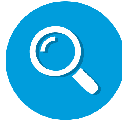
Scope of Work