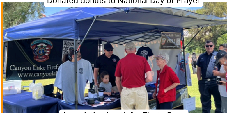
Association booth for Fiesta Days