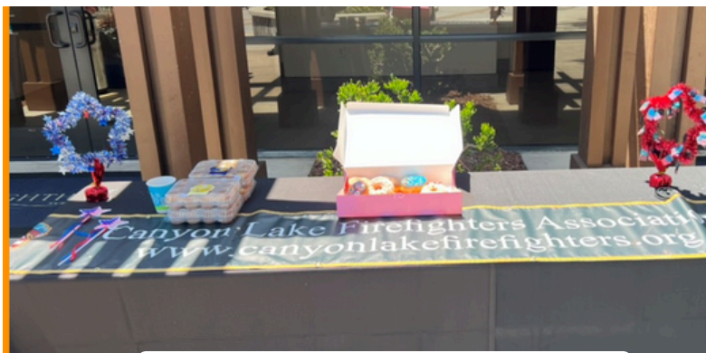
Donated donuts to National Day of Prayer