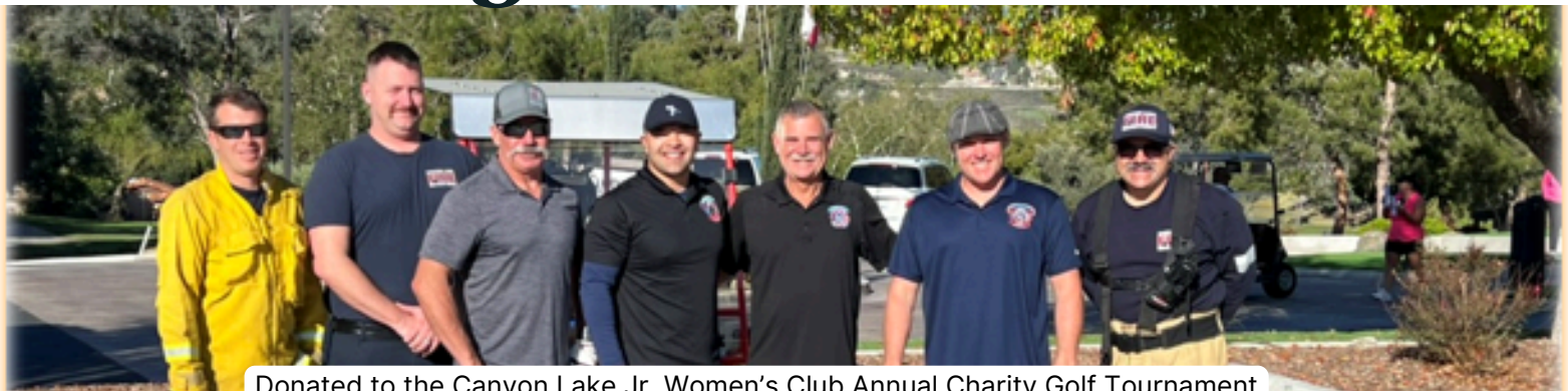
Donated to the Canyon Lake Jr. Women's Club Annual Charity Golf Tournament