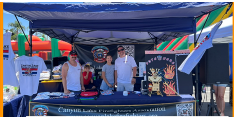
Canyon Lake Firefighters Association Golf Cart Show