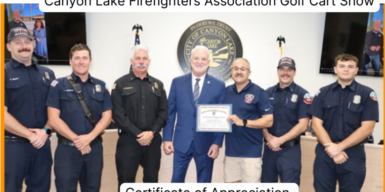
Certificate of Appreciation