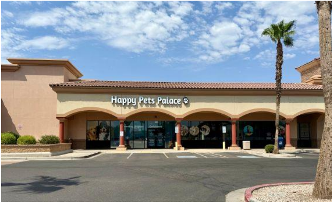
Front of building, looking from south to the north