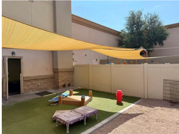
Two views of yard 1