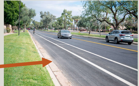
Bike lanes with 4ft buffer