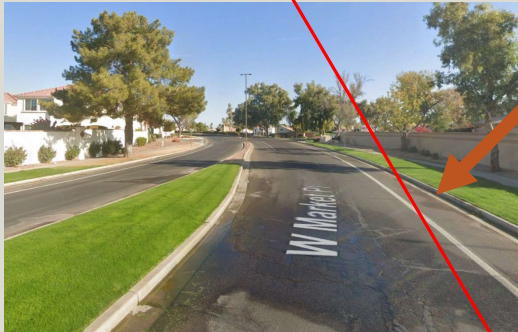
Bike lanes next to wide vehicular lanes