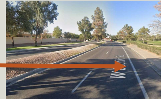
Bike lanes on arterial road