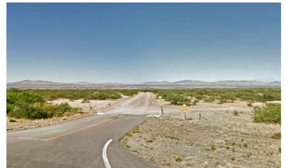
Existing Post Ranch Rd. Intersection with SR92.

Letters of support are anticipated from ADOT’s SouthCentral District Engineer, SEAGO’s Executive Director and the City of Benson’s Chamber of Commerce.