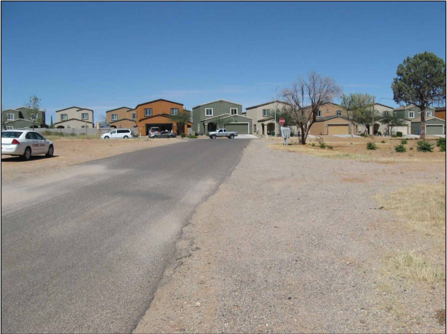
Looking north along N. 5 th street, showing the residences across Denman from the subject property.

level, but at approximately 90 feet of horizontal separation, they will primarily look right over the wall, except for the area directly adjacent to the wall, rendering the screening ineffective.