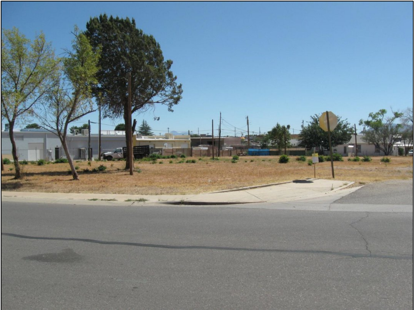
Looking southeast at the site

The Fry Townsite has been undergoing a concerted redevelopment effort, with the Applicant taking a lead role with multiple properties on 5 th and 6 th Streets. Since removing the distressed non-conforming 21-unit mobile home park, the Applicant has stated a desire to construct an office and storage building on this parcel, which is not permitted under the current MH-72 zoning, but is permitted under the General Business zoning.