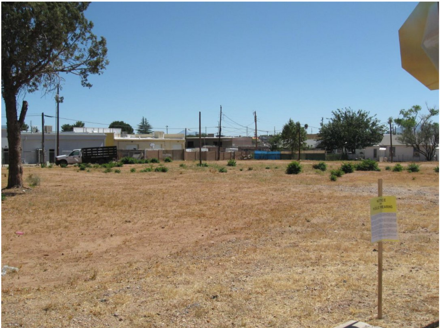
Looking east, showing the commercial development to beyond the alley

There are no applicable features on the parcel.