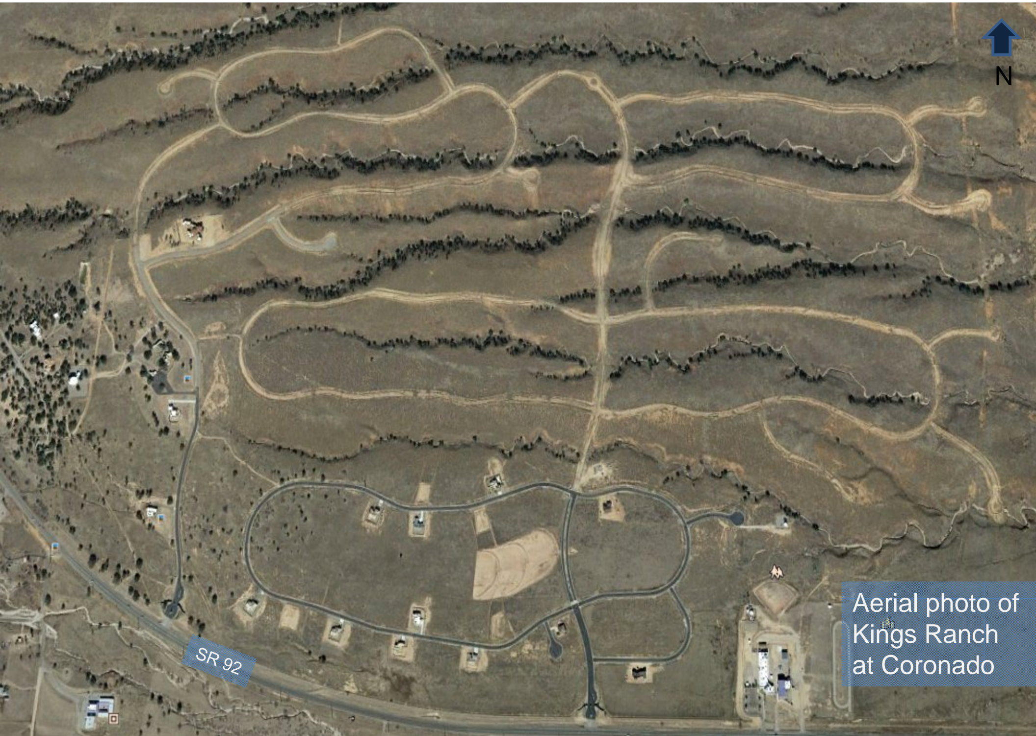
Aerial photo of Kings Ranch at Coronado