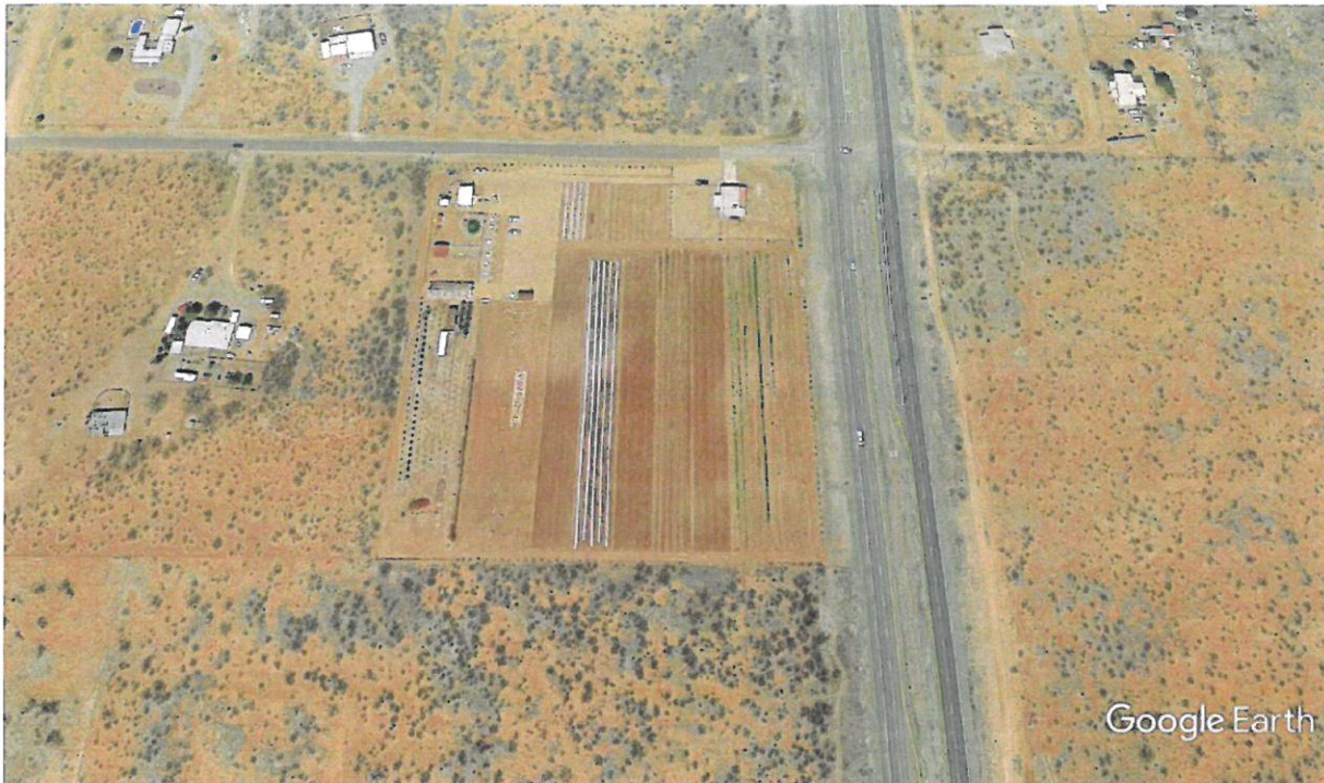
Little Family Farm, April 2013

Agriculture General - A tract containing a minimum of five (5) contiguous commercial acres which is being used for the production of farm, garden, or orchard crops, or the grazing or raising of farm animals, including feeding pens that are incidental and subordinate to a grazing operation. Examples of commodities produced include vegetables, fruit trees, grapes, cotton, grain, poultry, horses, cattle, sheep, and swine. The term "general agriculture" includes such uses as the necessary treatment, packing, or storage of farm products produced on premises, the sale of any farm crops or livestock raised on premises, and any signs, structures, or fences utilized for agricultural functions. By statute, "general agriculture" includes dairy operations, including areas designated for raising heifers and bulls owned by the same dairy operation that is on property contiguous to the dairy operation or within one-quarter of a mile. It does not include signs advertising off-premise facilities, junkyards, other retail sales, manufacturing, any non-agricultural services, stockyards, slaughterhouses/meat packing plants, commercial pen feeding, production wineries, bone yards, plants for the reduction of animal matter, poultry feeding operations, agricultural processing plants, or the growing of medical marijuana.