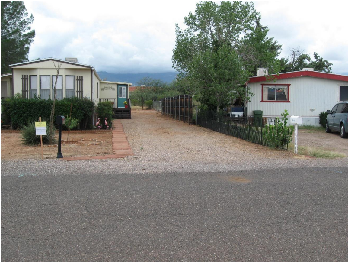
The proposed location of the carport.