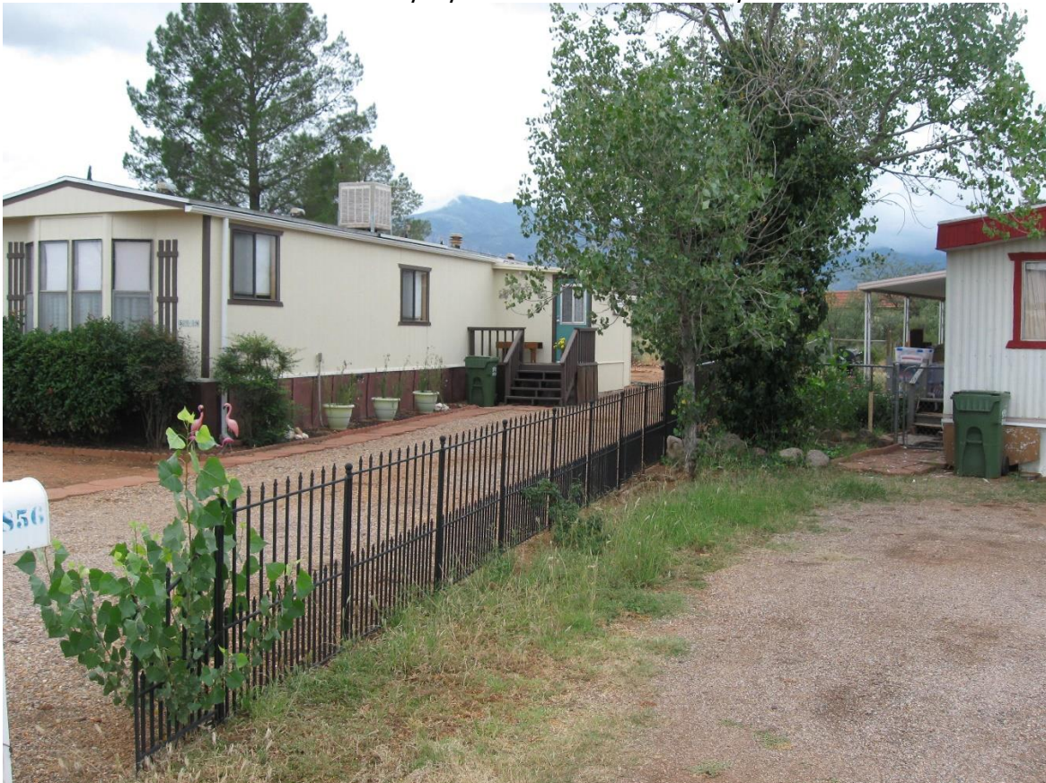
Looking from the street by the adjacent, impacted property.