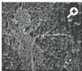
An aerial image shows where Dennis Finneran of Tucson, Arizona, had a marijuana garden in Bella Vista.

Another marijuana grower has filed a claim against Shasta County alleging sheriff's deputies illegally cut down 85 "large, healthy, bushy marijuana plants" growing on a Bella Vista property last summer, records show.