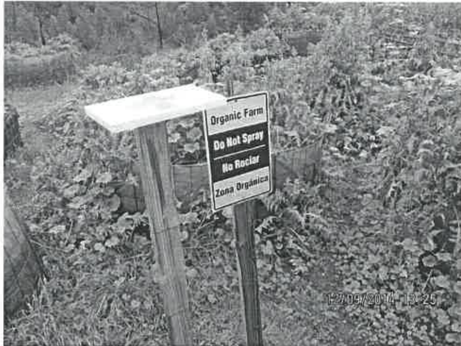
Courtesy photo A sign promotes a pesticide-free garden where Shasta County officials confiscated a 85-plant marijuana garden last year.