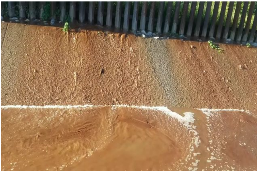
Video 1 – Flow at POE (9 Sept)