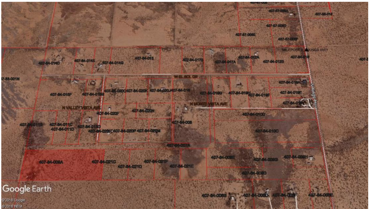
Site aerial with parcel highlighted in red