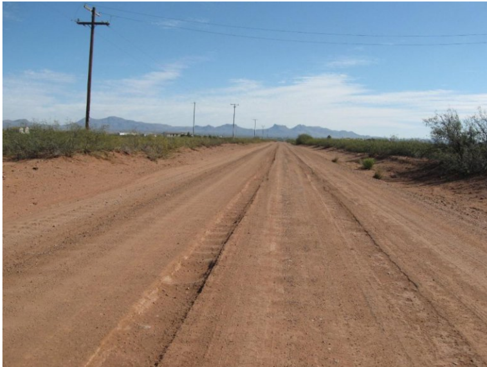
Portion of El Sol between Kings Highway and Valley Vista