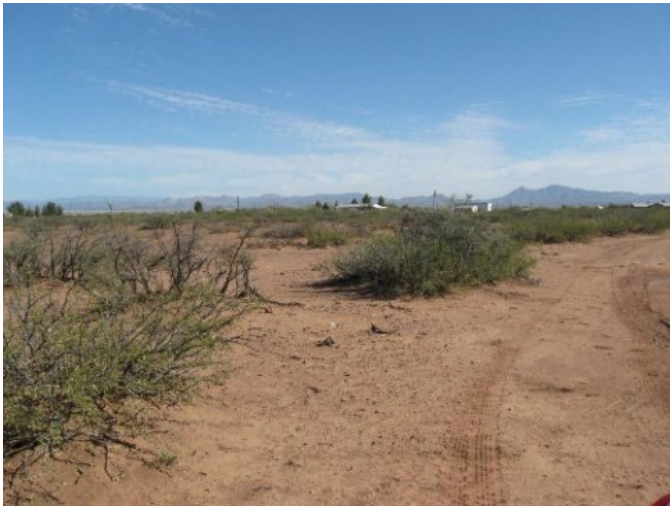
View the home to the northeast