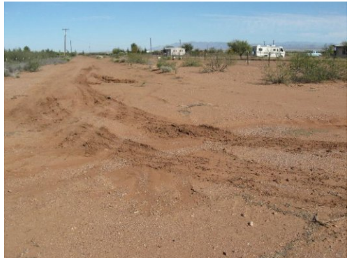
Intersection of Valley Vista and La Luna