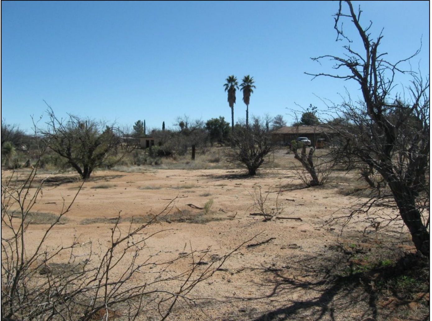
Looking northeast at the site, showing the existing home

Section 2208.03 of the Zoning Regulations provides fifteen criteria used to evaluate rezoning requests. Thirteen of the criteria are applicable to this request. Nine of the factors are met as submitted and the other four are met with conditions and modifications.