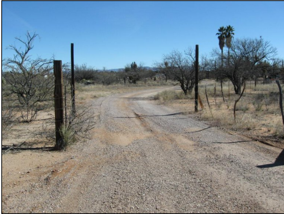
Existing access from Avenida Escuela