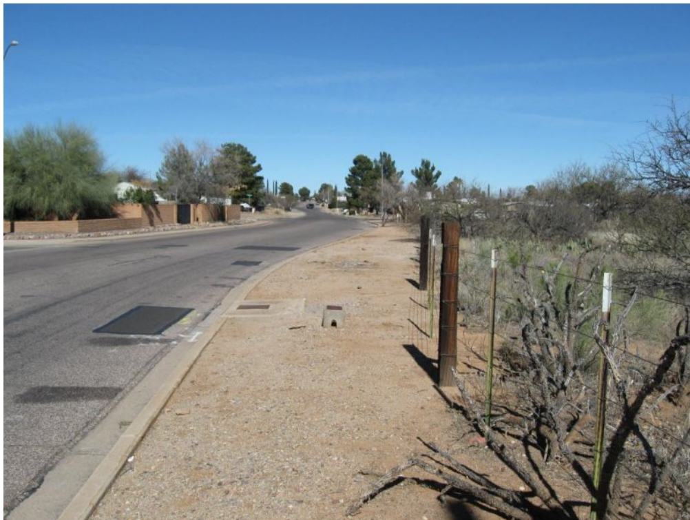
Looking east on E. Blue Bird Drive.