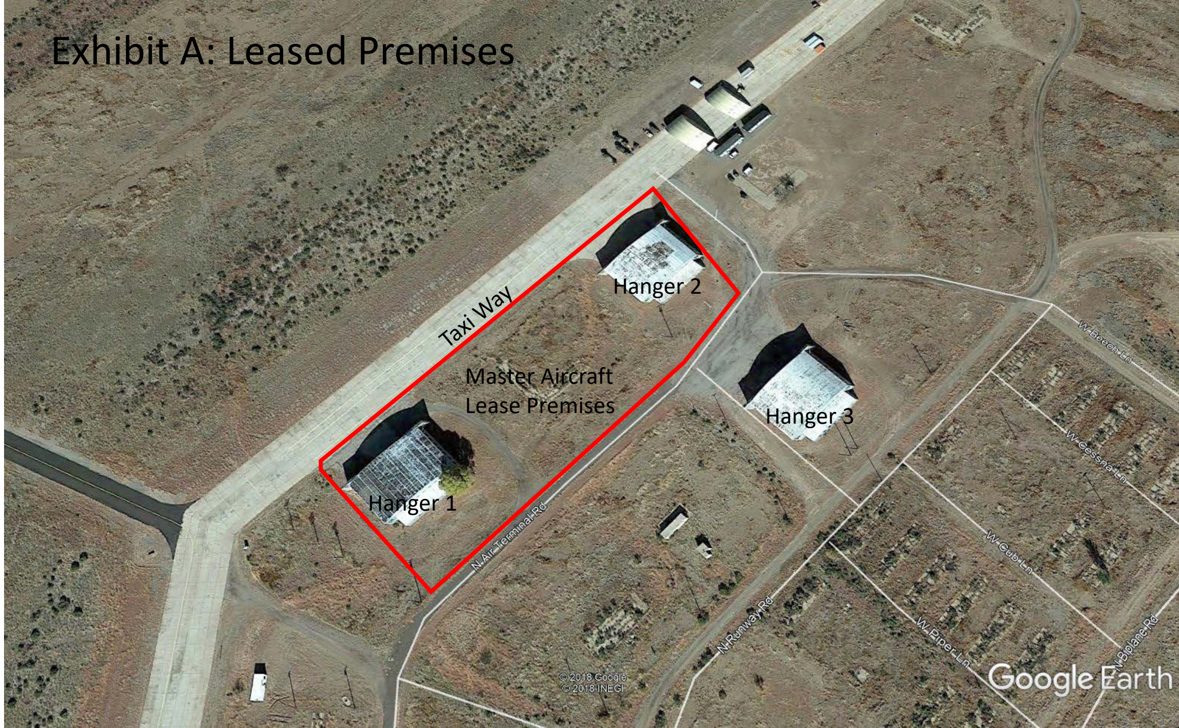
Exhibit A: Leased Premises