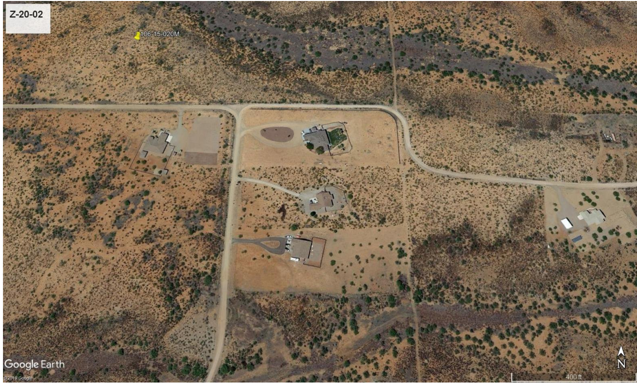
Existing RU-4 Residential Development in the Area