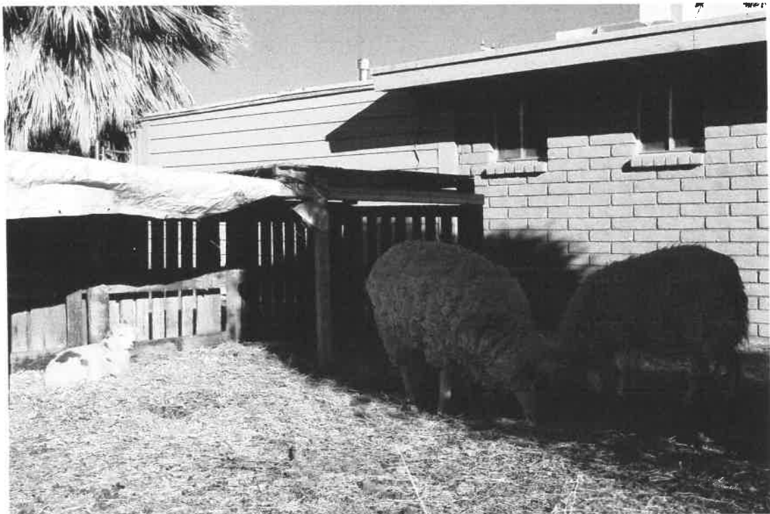
This image shows the three sheep and the 4'x12' pallet structure