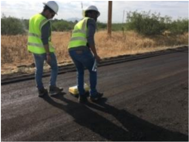
Subgrade fix north end of project. Remove additional 12" subgrade and replace with millings.