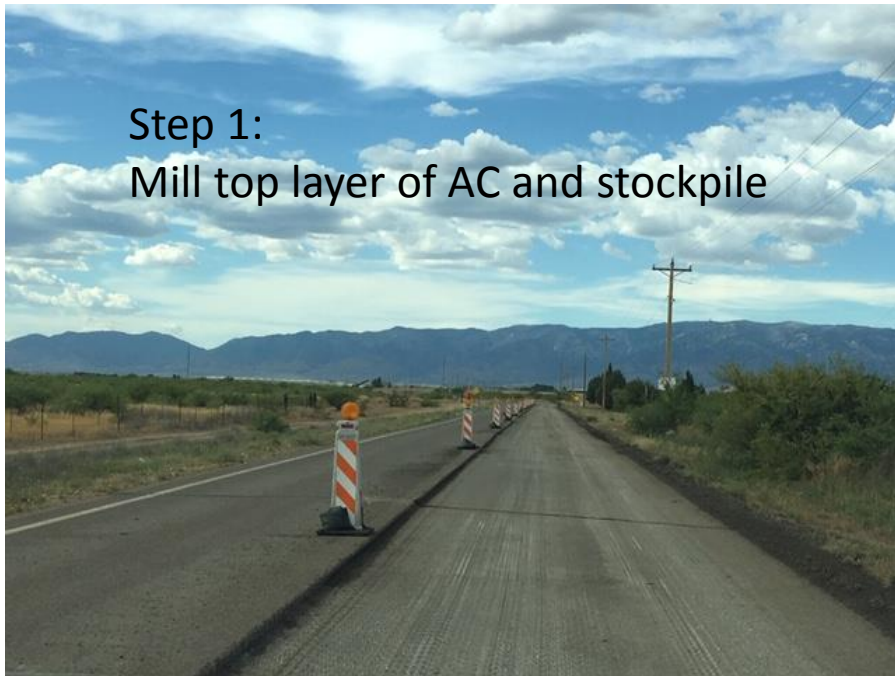
Step 1: Mill top layer of AC and stockpile