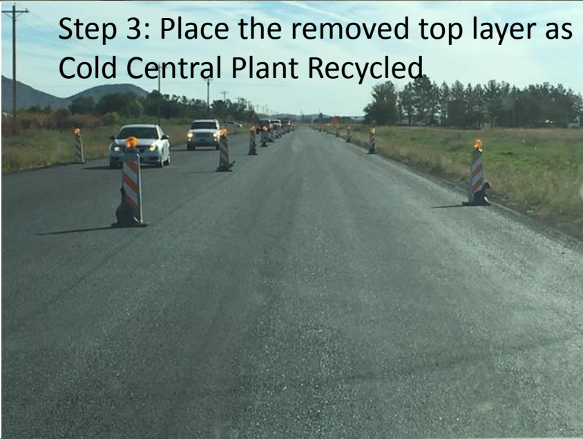
Step 3: Place the removed top layer as Cold Central Plant Recycled