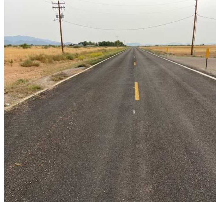
Sept 2020 Construction Completed