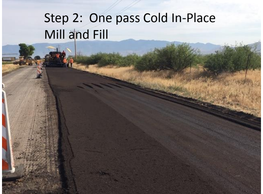
Step 2: One pass Cold In-Place Mill and Fill