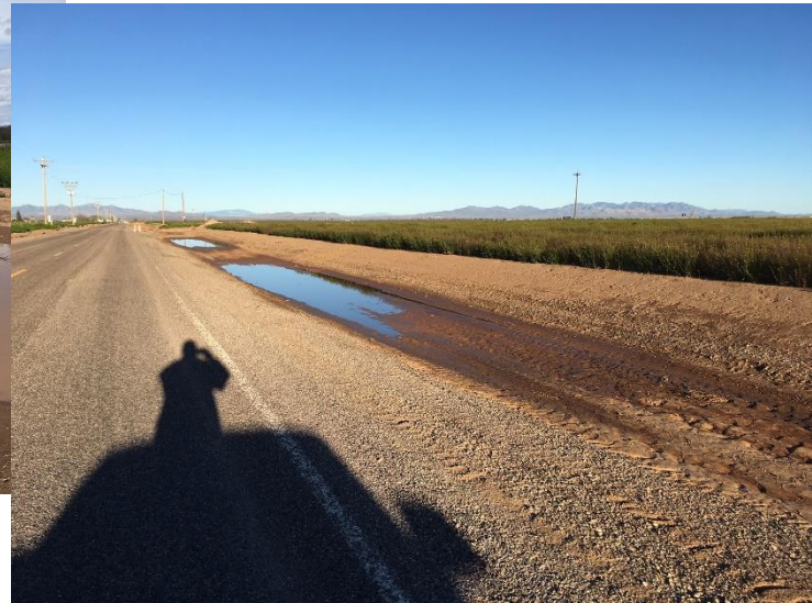
Winter Rains Nov 2019 through March 2020 delayed completion