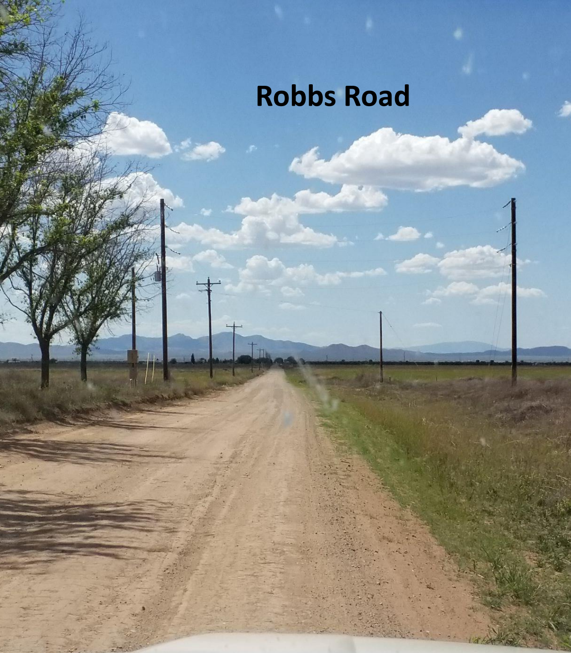
May 2019 Before Construction