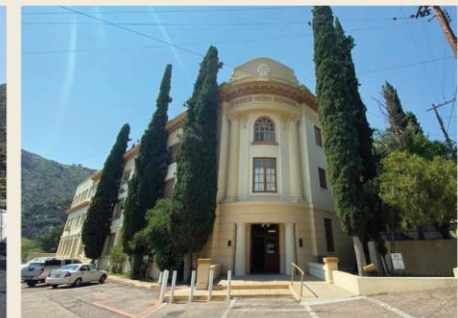
RECENT PHOTO OF MAIN ENTRANCE