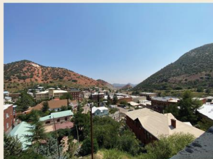
VIEW FROM BUILDING, LOOKING EAST