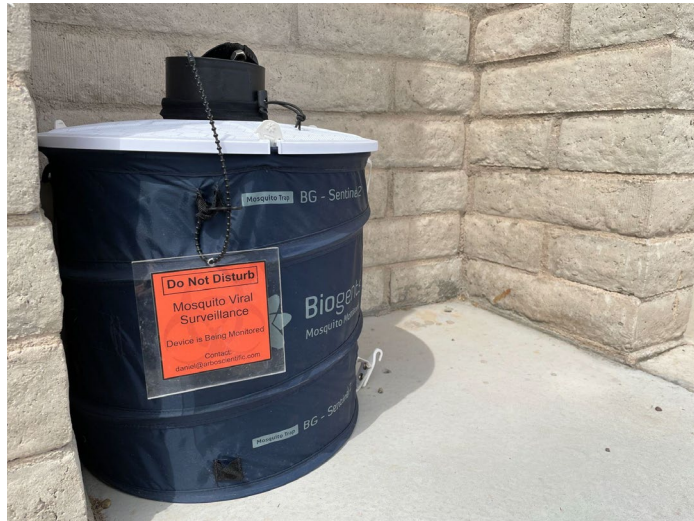
BG Sentinel surveillance trap.

Trapping locations will be identified with Cochise Health and Social Services for 21 traps that will reside in a fixed location for the season in order to provide accurate comparative data. 3 supplemental traps will be available for deployment in areas that have been identified as problem areas or areas that receive mosquito complaints. In between trapping years, fixed locations will be reevaluated if mosquito trap counts are minimal.