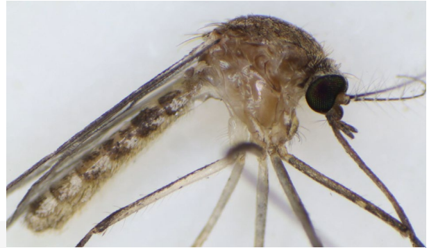
Common WNV and SLEV vector Culex quinquefasciatus .