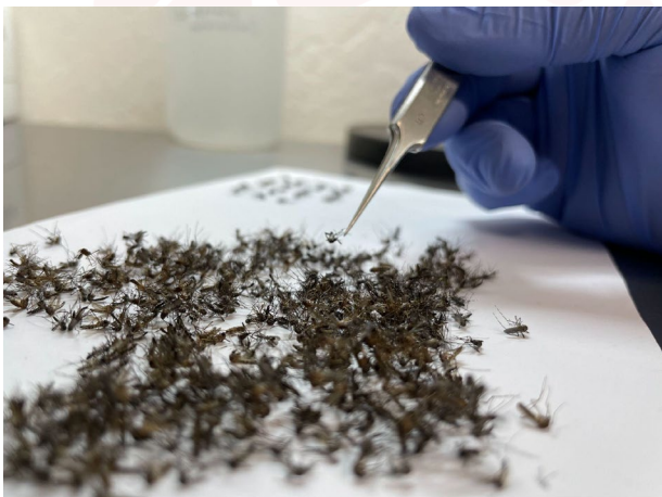
Sorting trap collections to species and sex.

Weather sensors will be deployed at many of the sites and will provide accurate temperature and relative humidity data at the site level. Sensors will be downloaded once per year and weather information will be provided to the county.