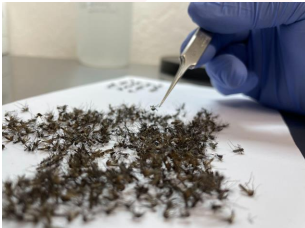
Sorting trap collections to species and sex.

In an effort to provide important public health information, Arbo Scientific will provide Cochise County with comprehensive vector and arboviral surveillance for four years by setting mosquito collection traps bi-weekly for 14 weeks between the months of April and October for the years 2023, 2024, 2025, 2026, and 2027. Traps will be set and collected within a 24 hour period. Collected specimens will be transported back to the Arbo Scientific lab in Tucson, Arizona to be sorted and identified to species and sex. Utilizing advanced technologies such as real-time quantitative polymerase chain reaction (RT-qPCR), the mosquito species common to the project area that pose significant risk to public health may be tested for the following potential viruses: Aedes aegypti specimens will be tested for dengue, Zika, and chikungunya