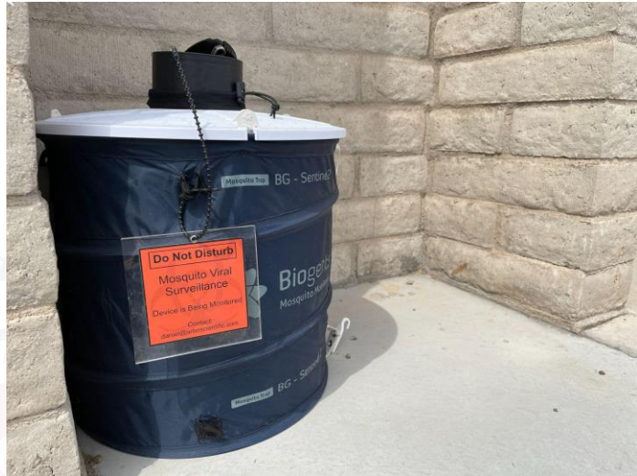
BG Sentinel surveillance trap.

Trapping locations will be identified with Cochise Health and Social Services for 21 traps that will reside in a fixed location for the season in order to provide accurate comparative data. 3 supplemental traps will be available for deployment in areas that have been identified as problem areas or areas that receive mosquito complaints. In between trapping years, fixed locations will be reevaluated if mosquito trap counts are minimal.