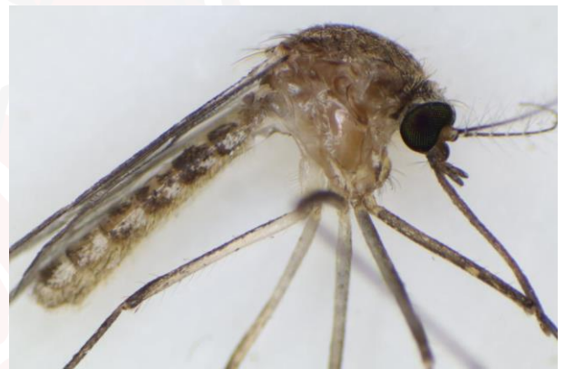
Common WNV and SLEV vector Culex quinquefasciatus .