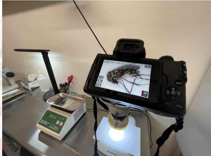
Aedes aegypti photo documentation during speciation.

Steven Young steven@arboscientific.com 602-717-7869