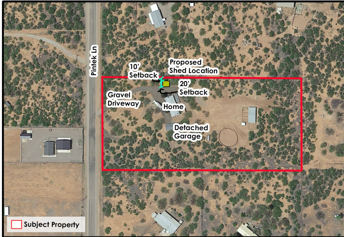
Site Analysis V 22-04 (Pintek Setback)