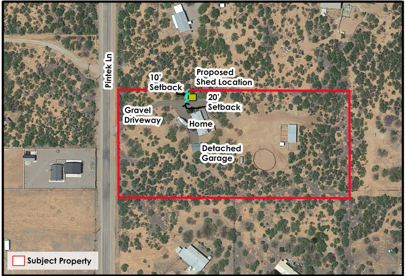
Figure 2: Site Analysis