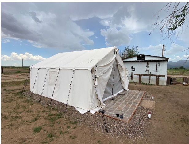
View of tent exterior