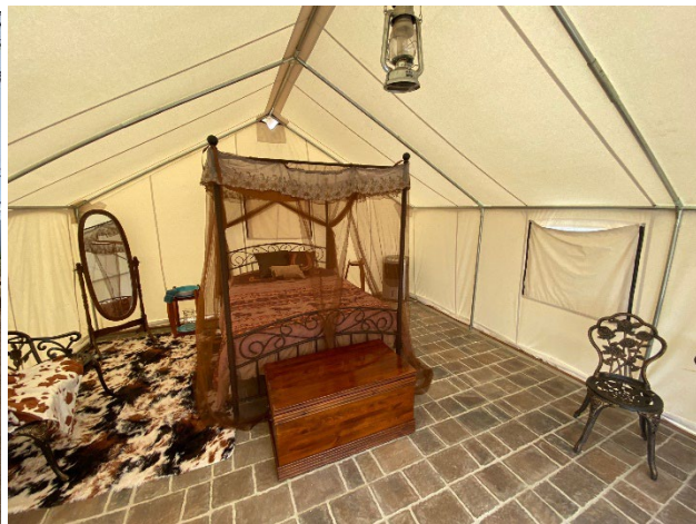
View of tent interior