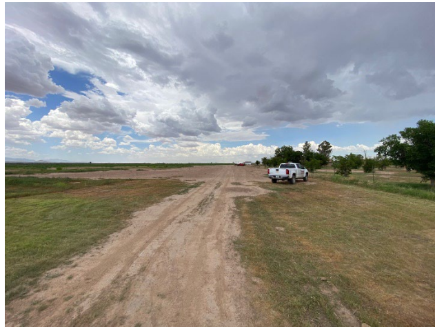
View of proposed parking area on west side of property