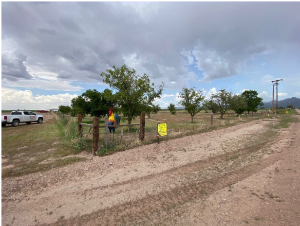
View of south property line, showing Gleason Road, looking east