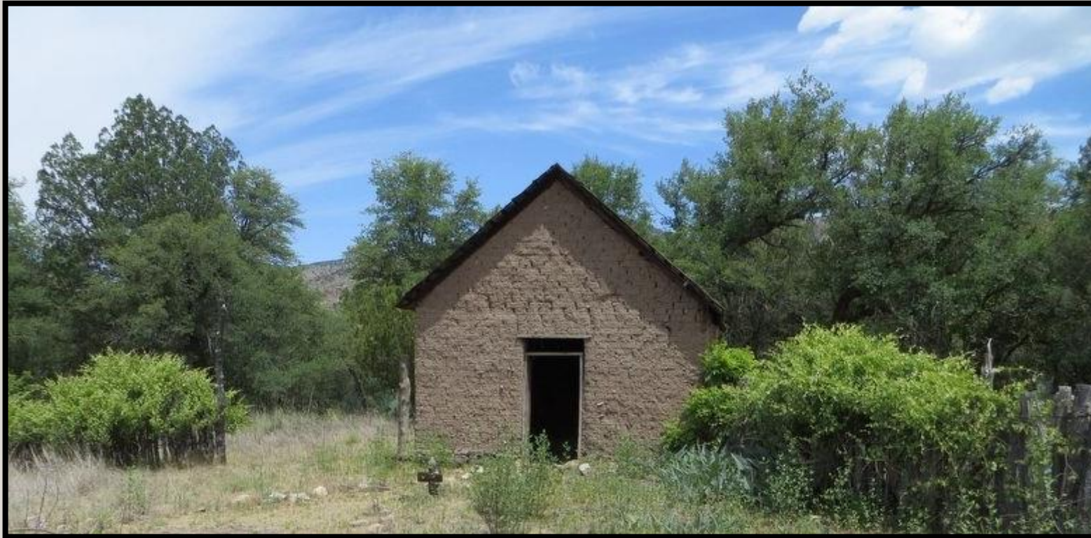
CAMP RUCKER BAKERY | 1879