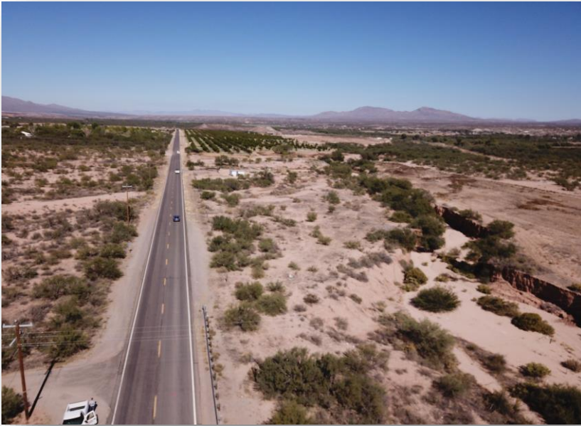
Subject property, viewing north