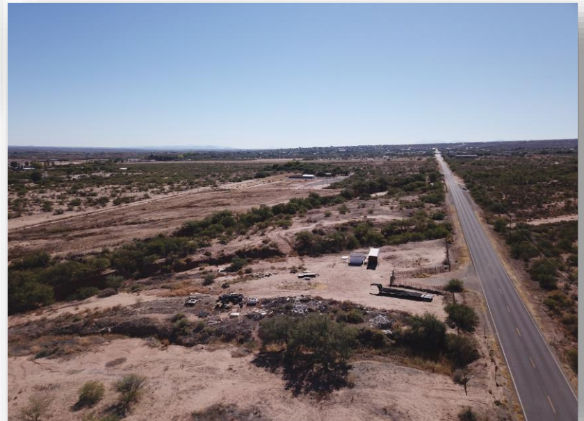
Subject property, viewing south