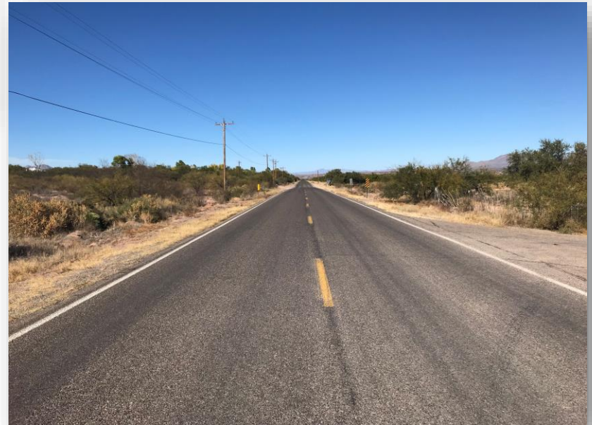
Ocotillo Road, viewing north