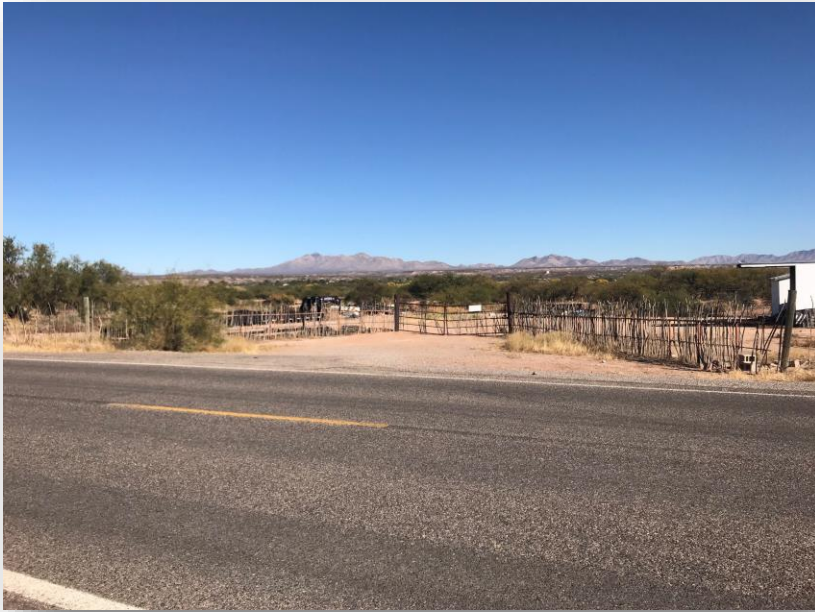
Property entrance along Ocotillo Road