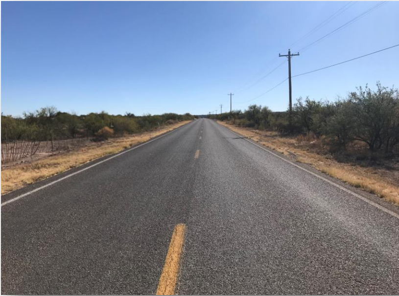
Ocotillo Road, viewing south to I-10