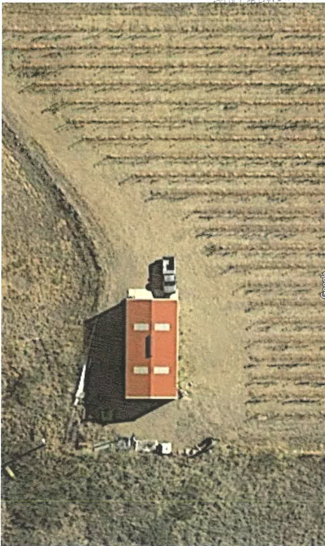
Close up of Building