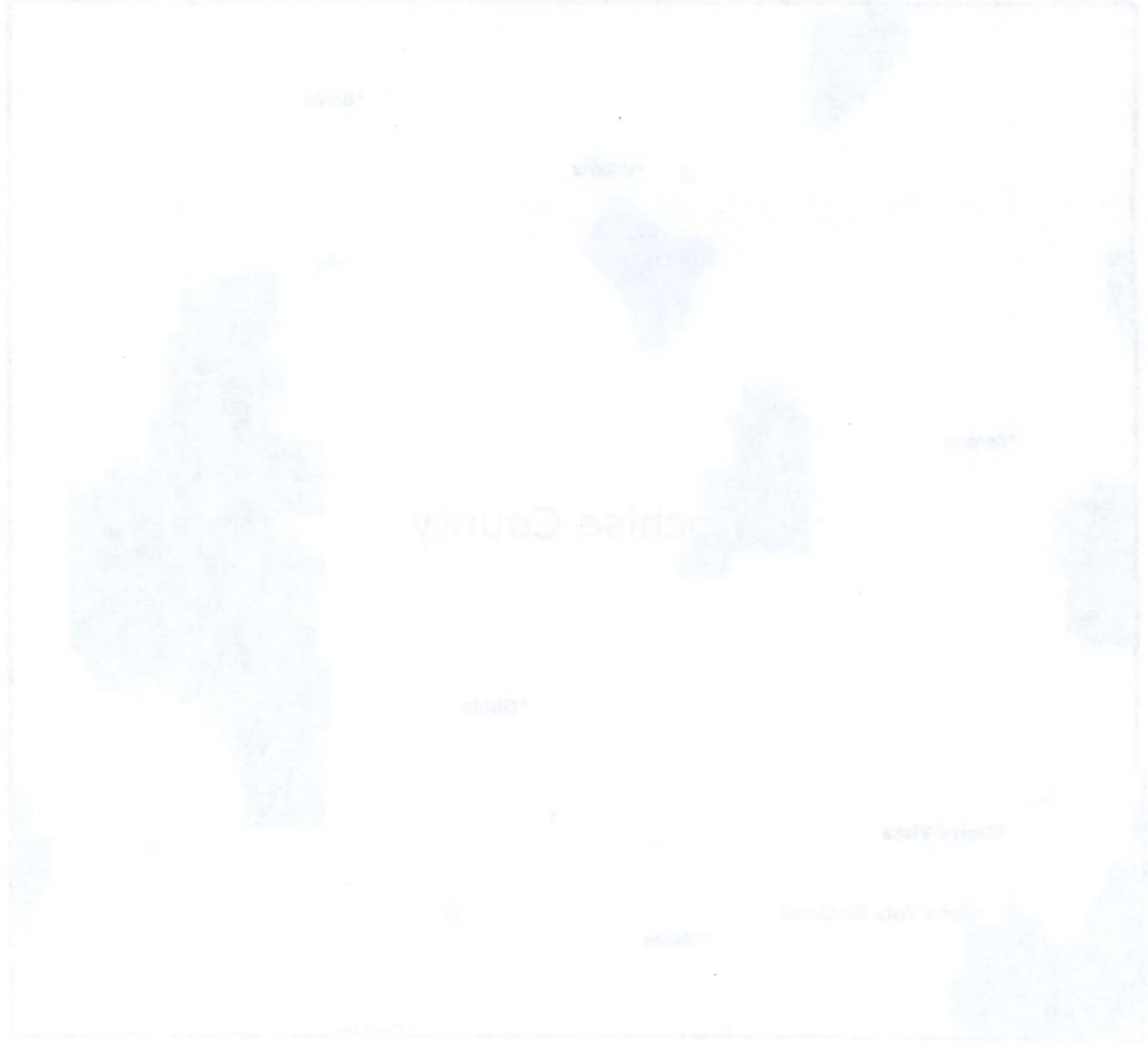
EXHIBIT B [SERVICE AREA]