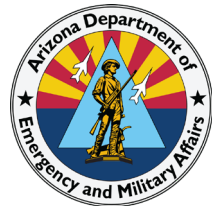
Major General Kerry L. Muehlenbeck THE ADJUTANT GENERAL

5636 East McDowell Road Phoenix, Arizona 85008-3495 (602) 267-2700 DSN: 853-2700