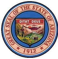
Katie Hobbs GOVERNOR