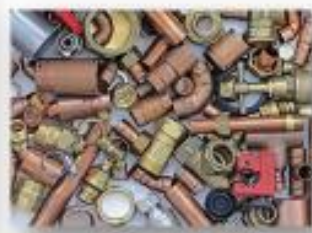
Brass and Copper