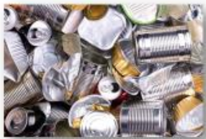
Clean Food Tins with labels removed, Aluminum Foil, Aluminum Cans