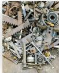
Sheet Metal and Steel