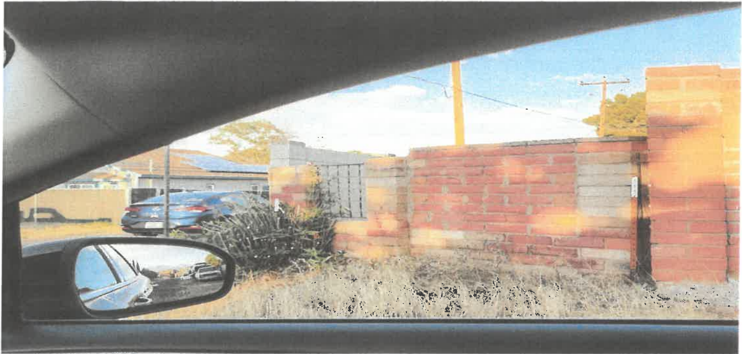
Picture 6 Of Opposite Side of N. Fifth St