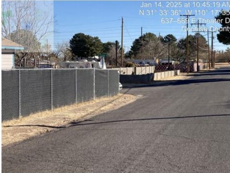
Photo 9 – Vehicle is stationed on Sixth Street, 15' from the edge of road of Theater Drive. Photo was taken approximately 80' West of N Sixth Street on Theater Drive.