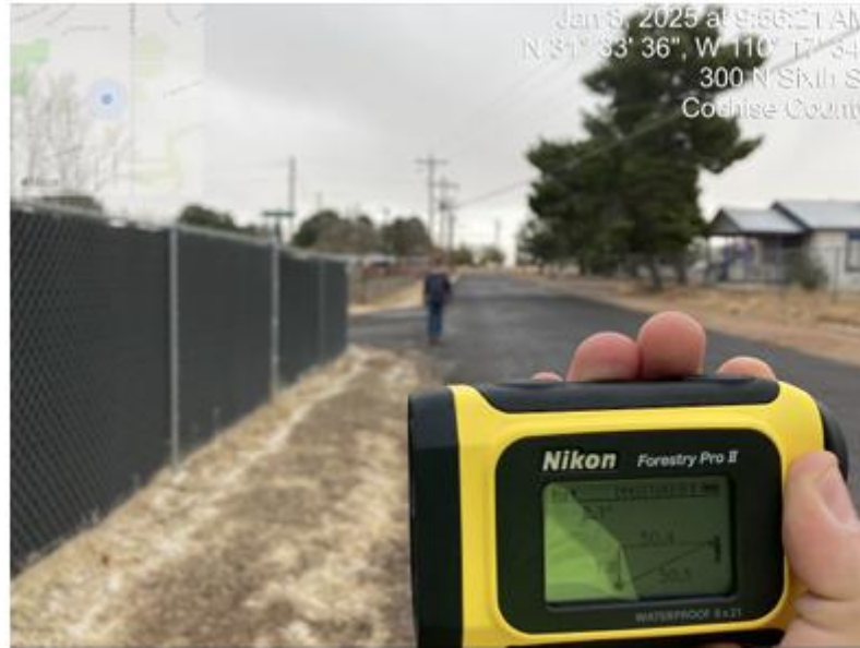
Photo 2 & 3 – Photo taken on E Theater Drive 50.4' from Intersection of N Sixth Street. Vehicle at stop sign is not visible.