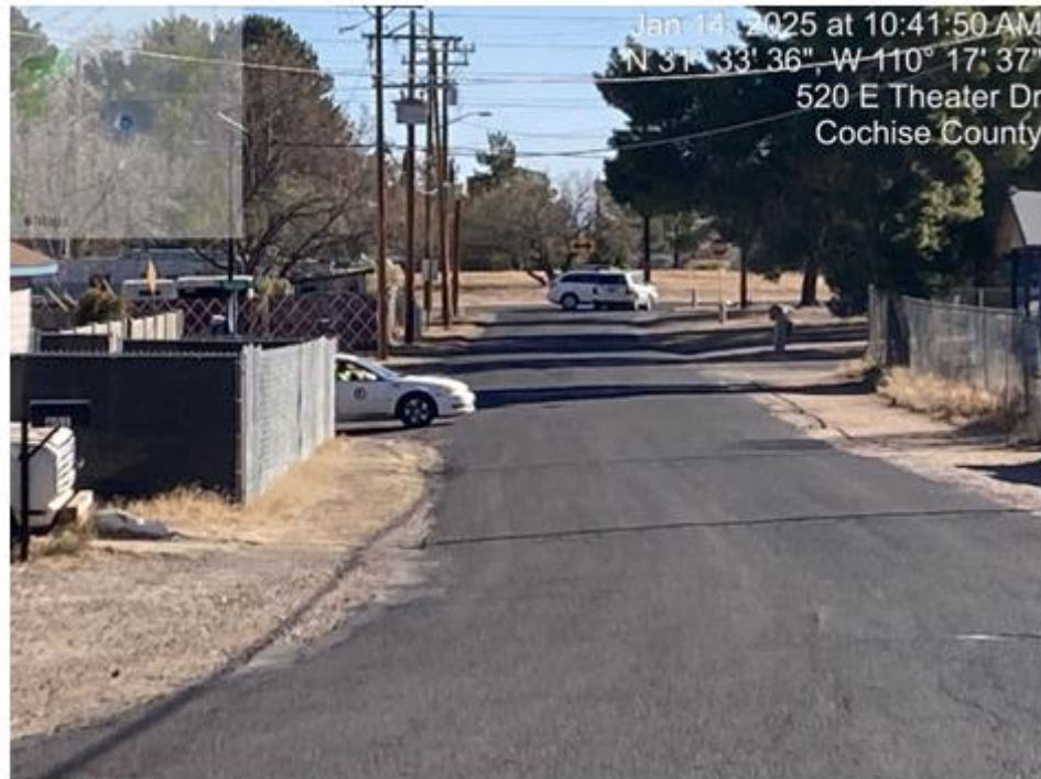
Photo 6 – Photo showing the car location where the driver has the ability to see oncoming traffic from the West.