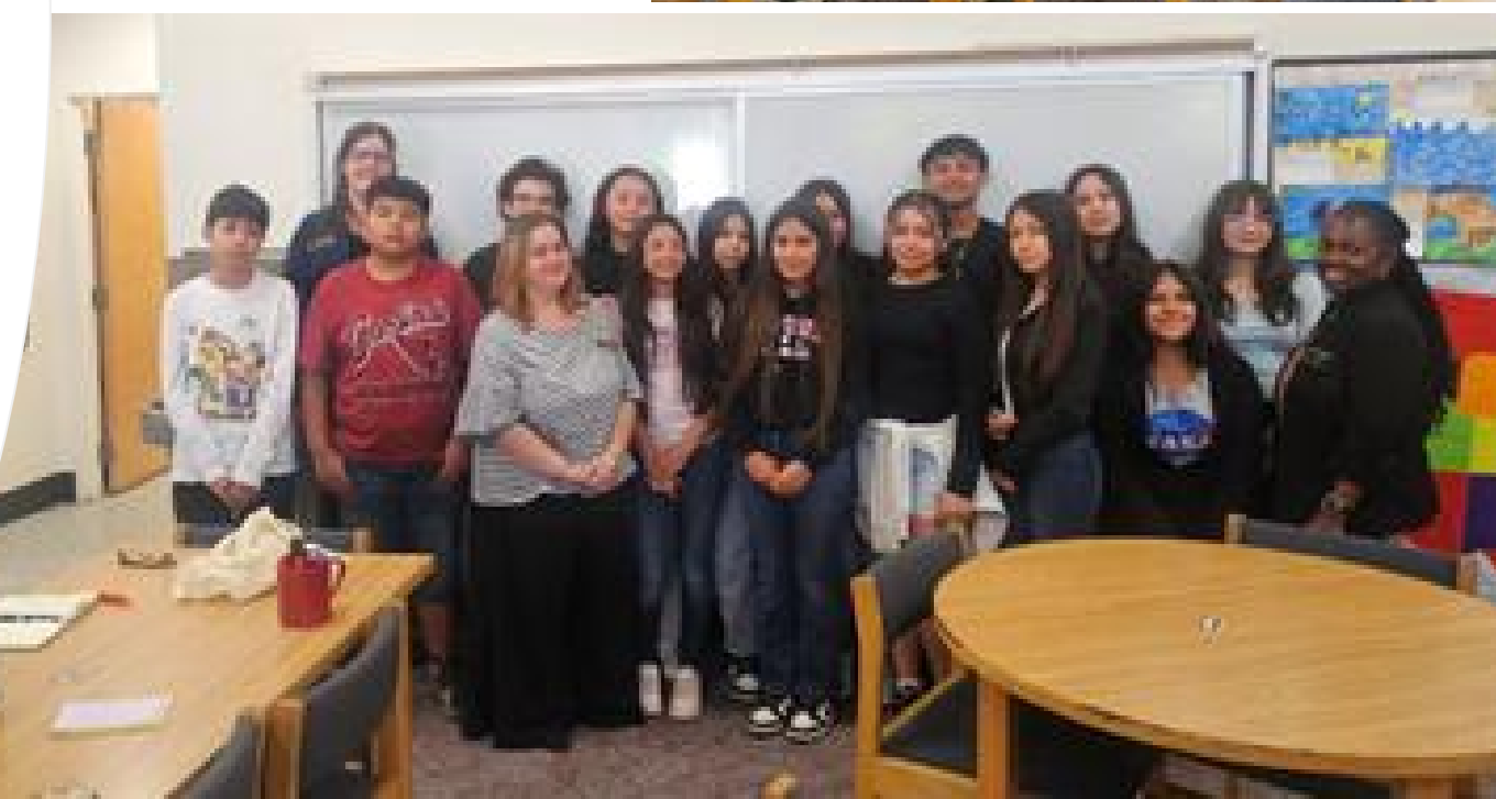
Chill & Chat with SAC Ambassador, Naco Students & County Superintendent Advisors