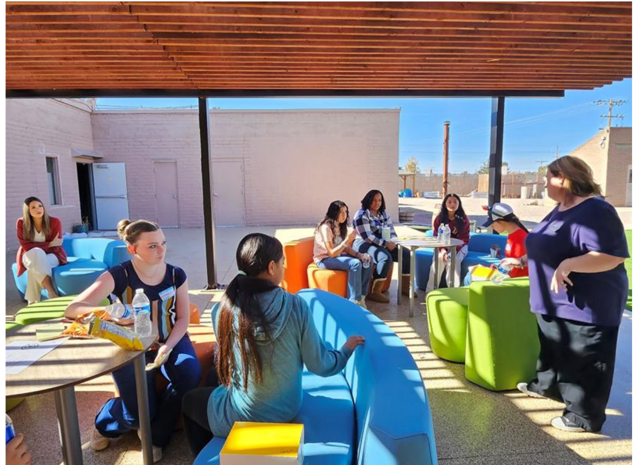
SAC Leadership Workshop