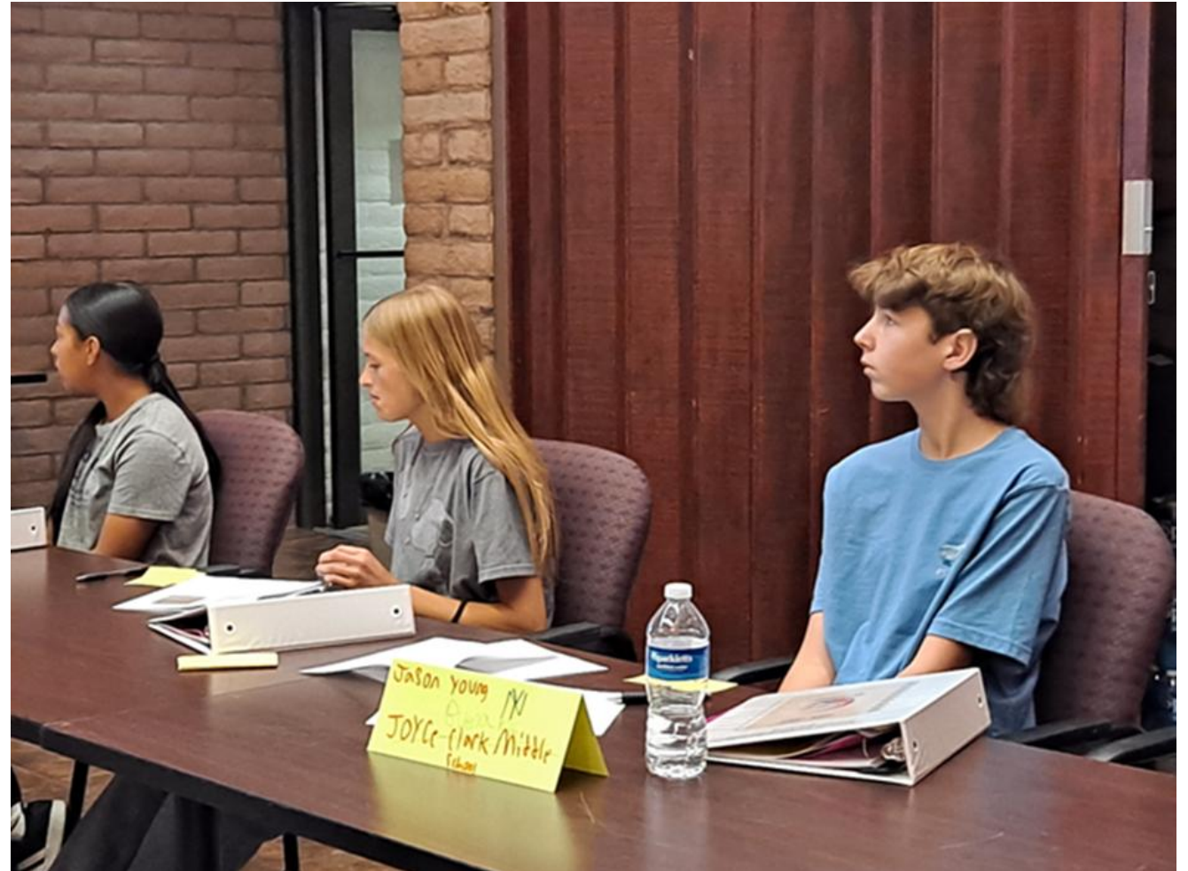
SAC Leadership Workshop

Anonymous Concern Box Connect with School Student Councils Anti-bullying Billboards