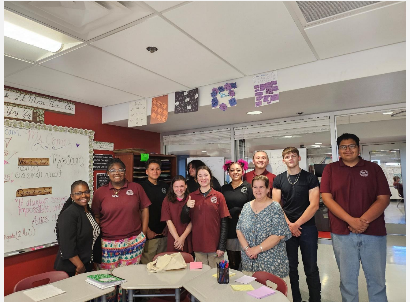
Chill & Chat with Ambassadors, PPEP TEC Students, & County Superintendent Advisors