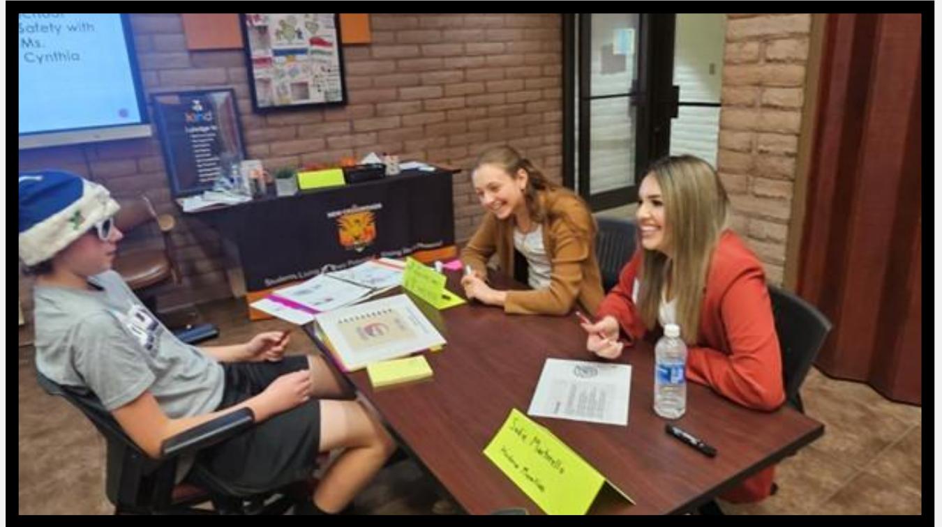
SAC Leadership Workshop

Build relationships between adults and students where all voices are equal