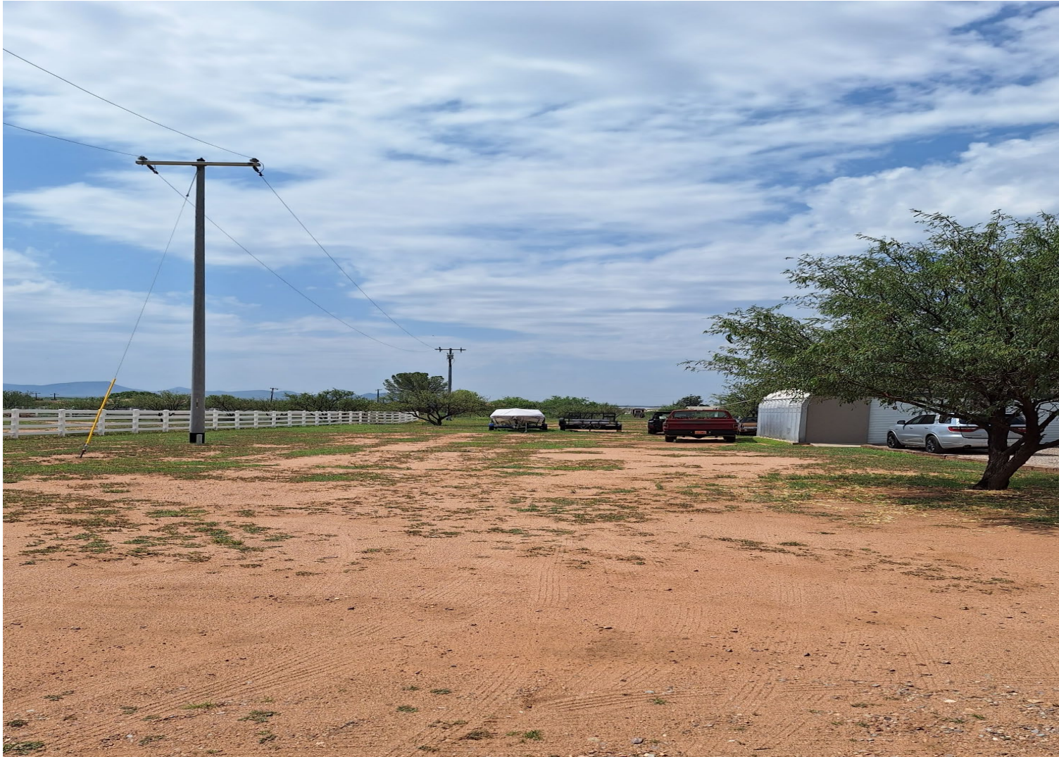
The view from E Valley Winds, looking south towards Cline Ave.