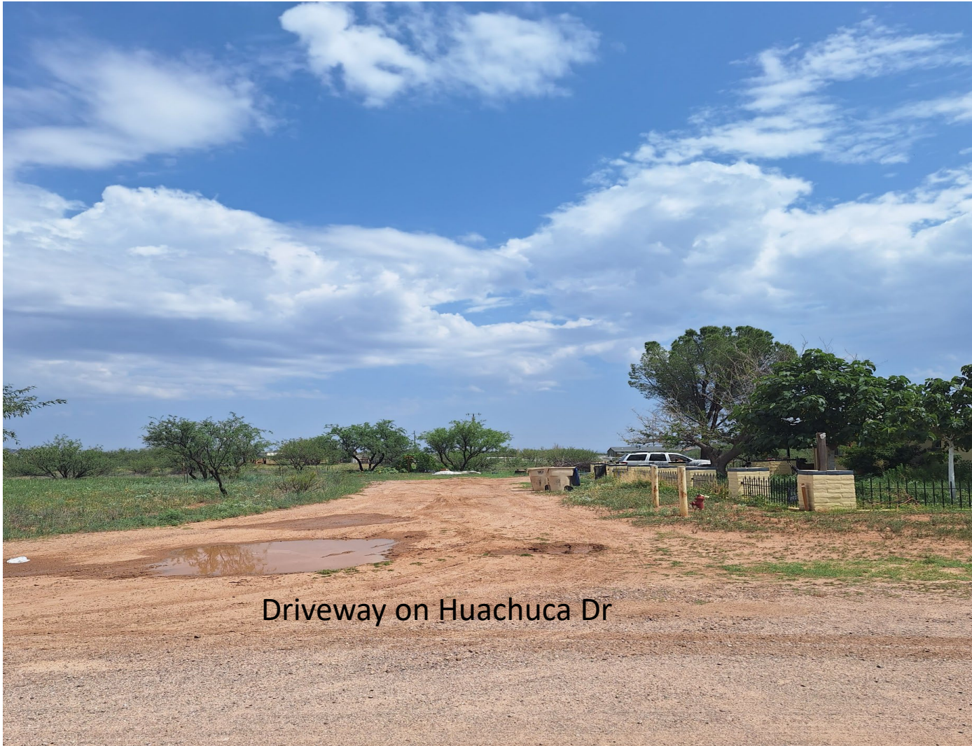
Driveway on Huachuca Dr

The view of the from Cline Ave, looking north towards E Valley Winds Ave.