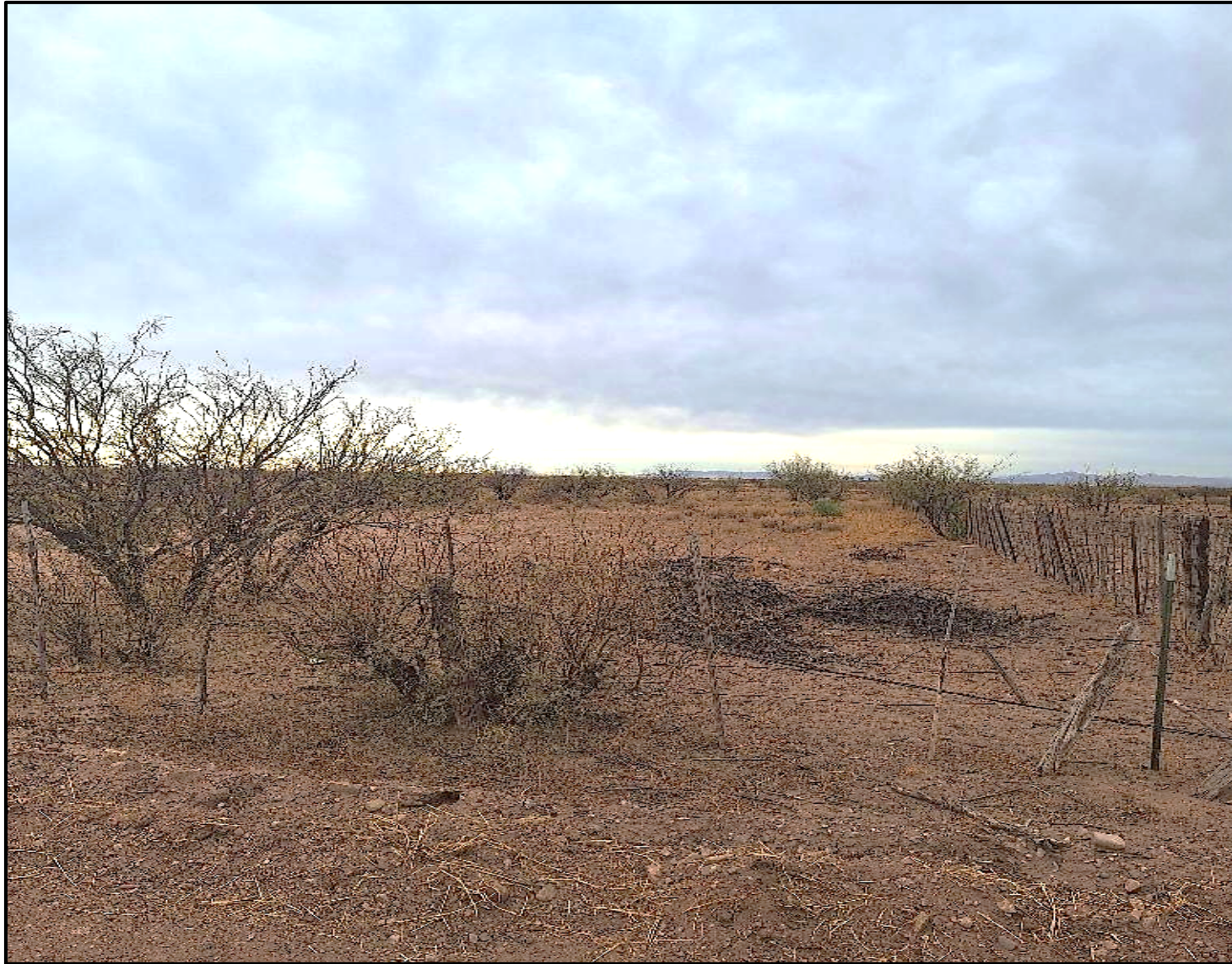
The view looking south towards Bagby Rd.