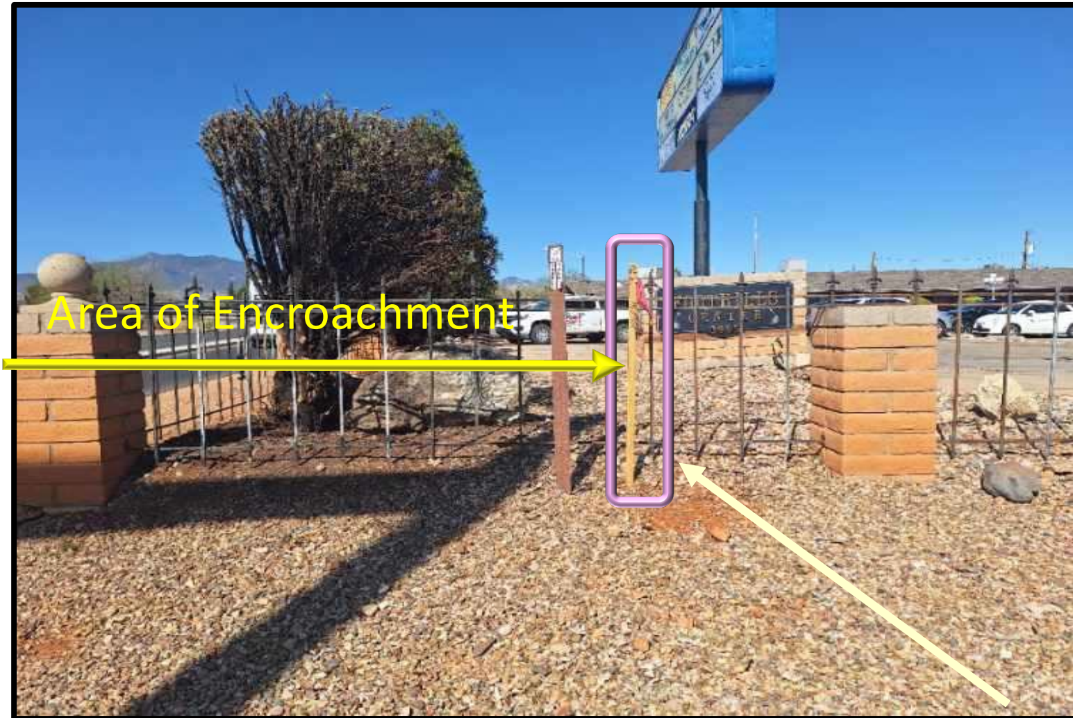
Surveyor's stake and flag marking the Property Line