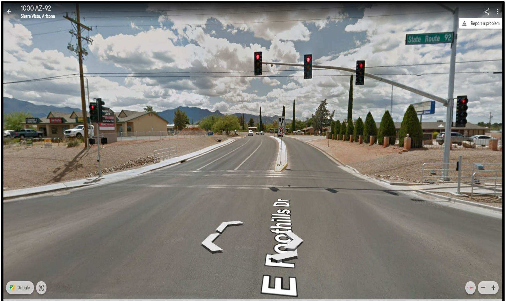
Google street view, looking west from State Route 92