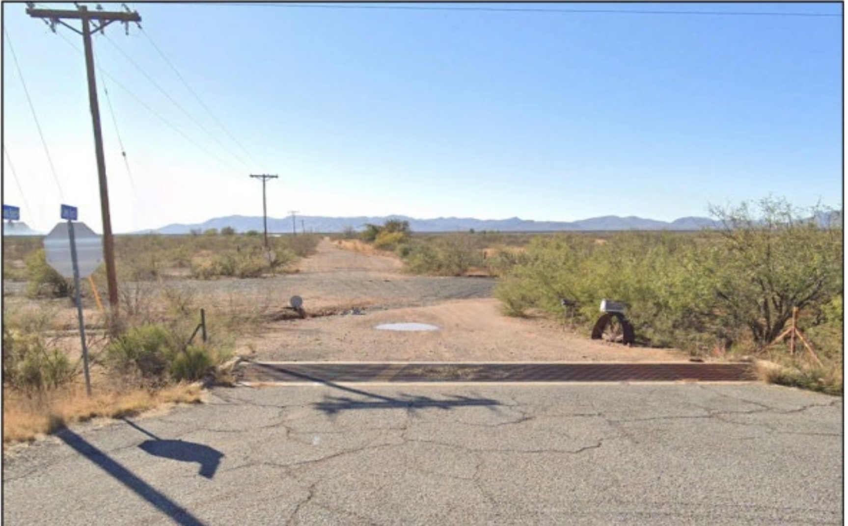
James Ranch Road Street View looking South from HWY 80