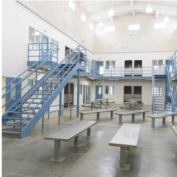
CDCR, R.J. Donovan State Prison, San Diego, CA.