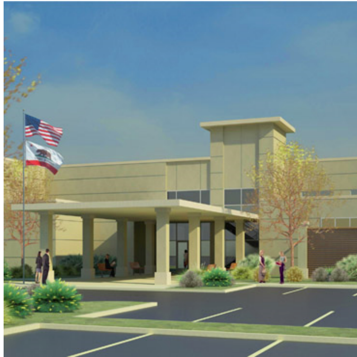
California Department of Corrections and Rehabilitation, (CDCR), Reentry Program, California Statewide