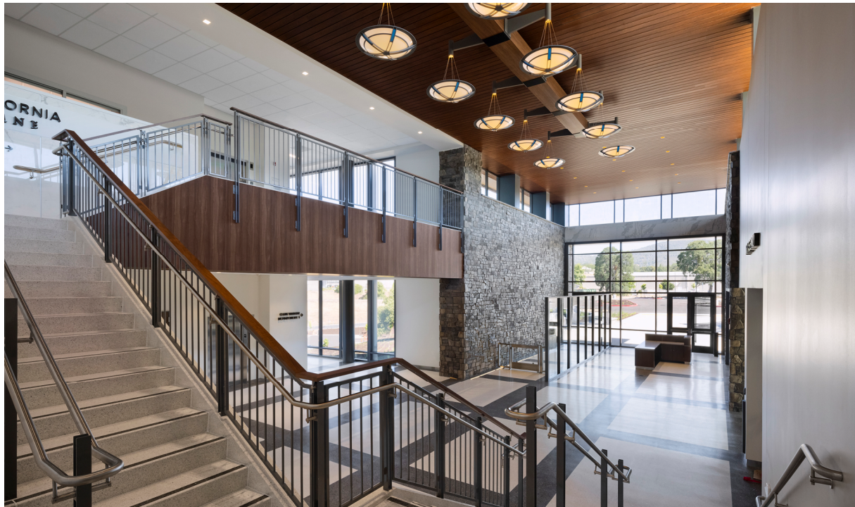
State of California Judicial Council, New Hanford Courthouse, Hanford, CA