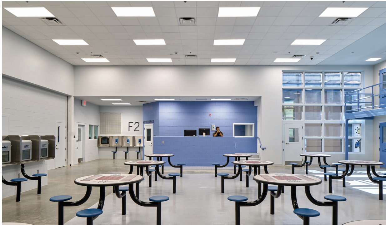
Hays County Jail Expansion and Renovation, San Marcos, TX.