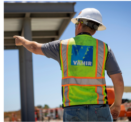
Utilize money efficiently