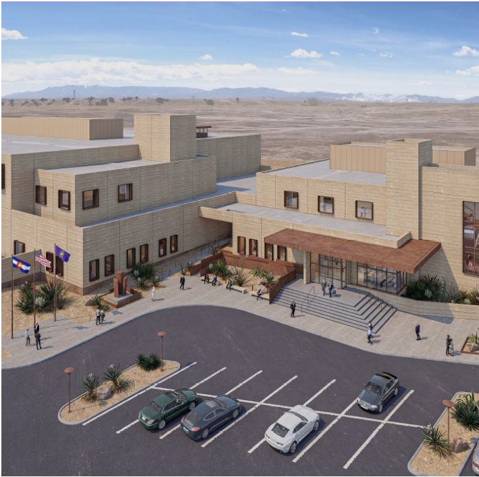
Pueblo County Detention Center, Pueblo, CO.