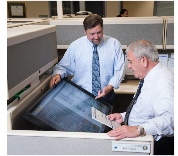
Planning phase and coordination