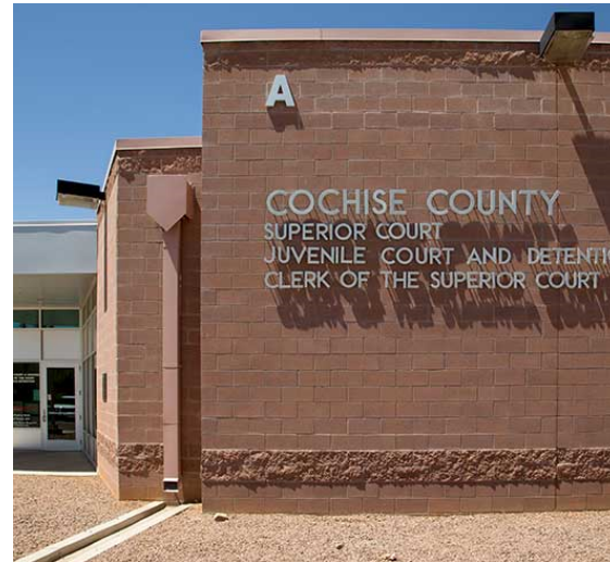
Impacts to the Judicial System