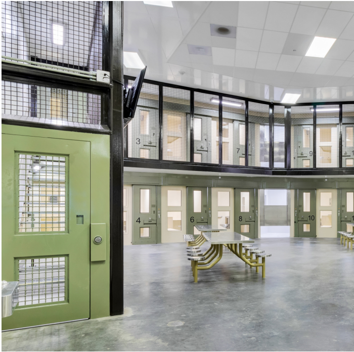
County of Riverside, John J. Benoit Detention Center, Indio, CA.