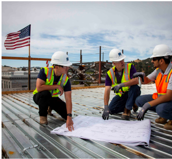
Project needs for the Justice Center