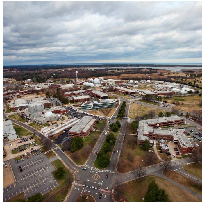
NASA's Langley Research Center in Hampton, VA.