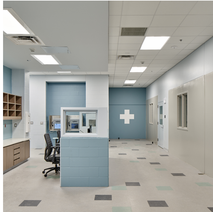
Hays County Jail Expansion and Renovation, San Marcos, TX.