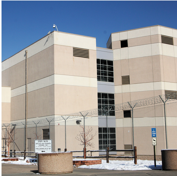
Adams County Detention Facility Replacement, Brighton, CO.