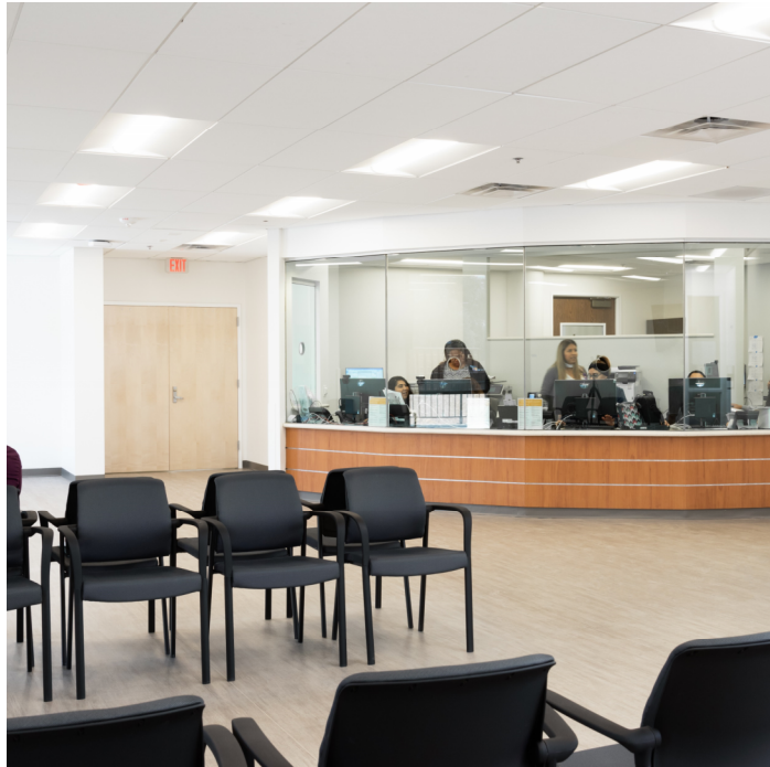
Valleywise Behavioral Health Center, Maryvale, AZ.