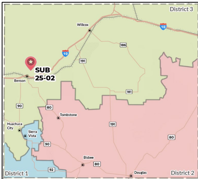
Figure 1: Property Location

The County received a subdivision plat request in the Pomerene area of Cochise County from Calvin Housley (applicant). The proposed subdivision consisted of 8-lots on 36.44-acres zoned RU-4. It is generally located east of Pomerene Road, one mile northeast of Benson city limits in Supervisor District 3.