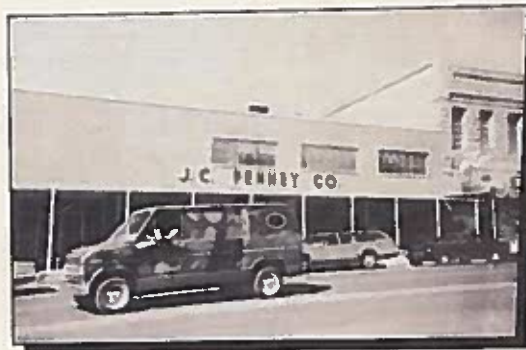
This two-story concrete block structure is clad with pinkish brick on the upper story and purplish marble on the street level.

The building is representative of the 1950's chain store prototype using modern extruded aluminum storefront construction with full display glass and broad Mainstreet frontage. The closure of the Penney's retail store reflects a major shift in downtown retailing in rural communities. The big box style retailers are typically locating outside of downtown areas near the fringe or edge of communities. The building was purchased by the Curtis and Stockdale families in 1996 and the Office Outpost store was relocated to this location that year.