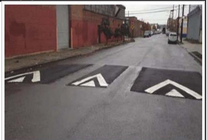
Examples of potential options.