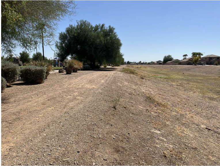
Photo 3 - Existing Path Near Buena Vida Park