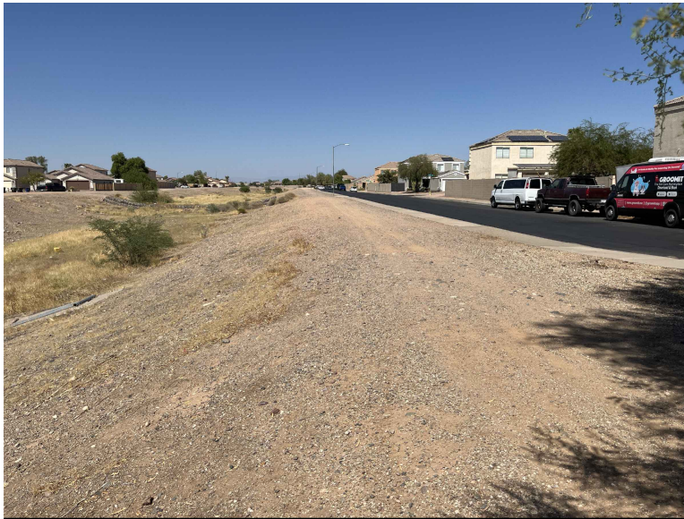
Photo 2 - Existing Path Along El Mirage Wash at 124th Lane & Larkspur Road

File Path: I:\Capital Improvement Projects\24-25 CIP\CDBG\Multi-Use Trail_Phase 2\Project Location Exhibit.dwg