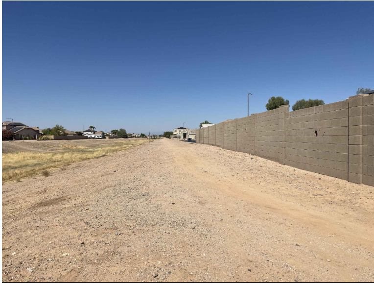
Photo 1 - Existing Path North of Hohokam Multi-Use Trail