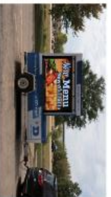
8mm – 40ft