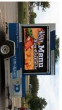
6mm – 25ft