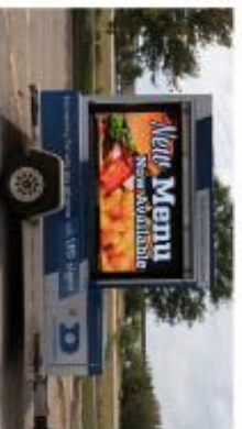
8mm – 25ft