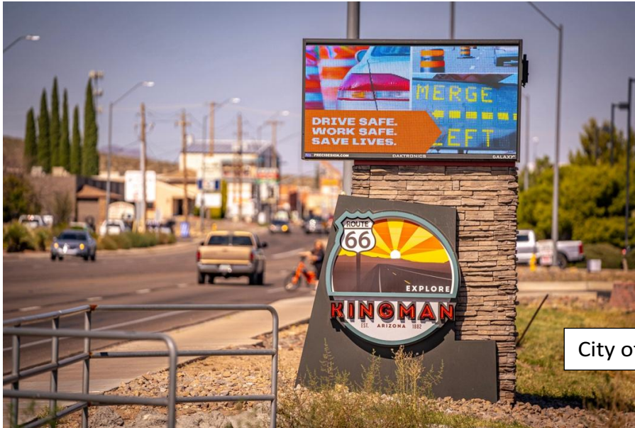
City of Kingman, AZ