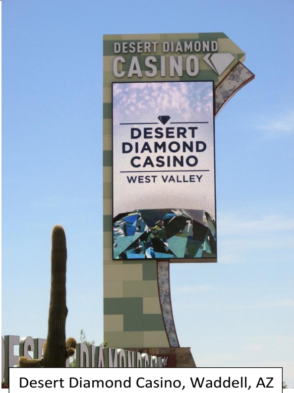
Desert Diamond Casino, Waddell, AZ