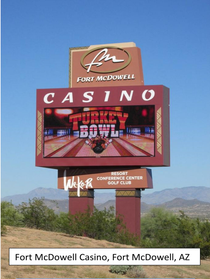
Fort McDowell Casino, Fort McDowell, AZ