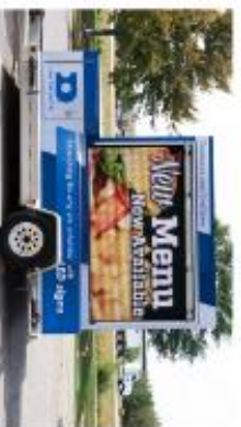
15.85mm – 25ft