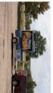
10mm – 60ft