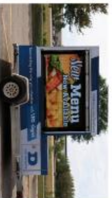
10mm – 25ft