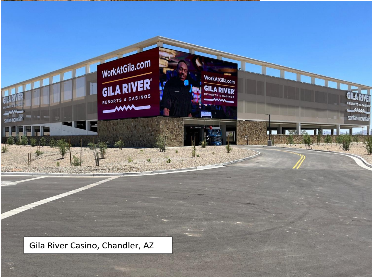
Gila River Casino, Chandler, AZ