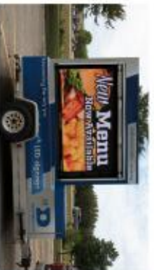
6mm – 25ft