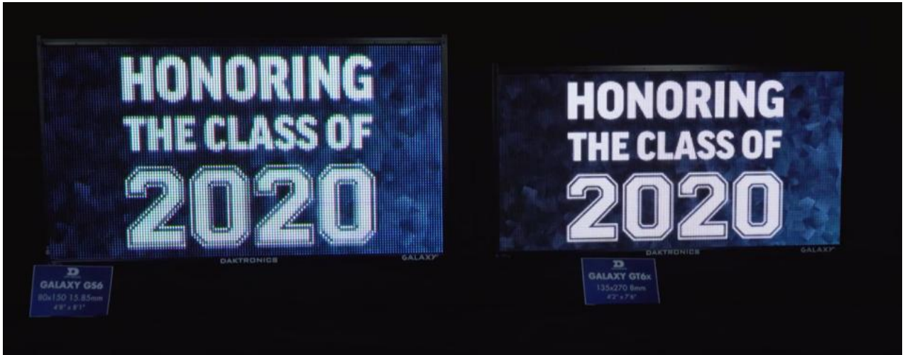
Resolution – 15.85mm

This image shows the difference between various resolutions. The image on the left is 15.85mm and the image on the right is 8 mm. The resolution upgrade recommended for El Mirage is to 8mm from 19/20mm to increase clarity and overall readability.