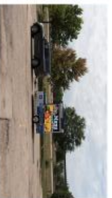
15.85mm – 80ft