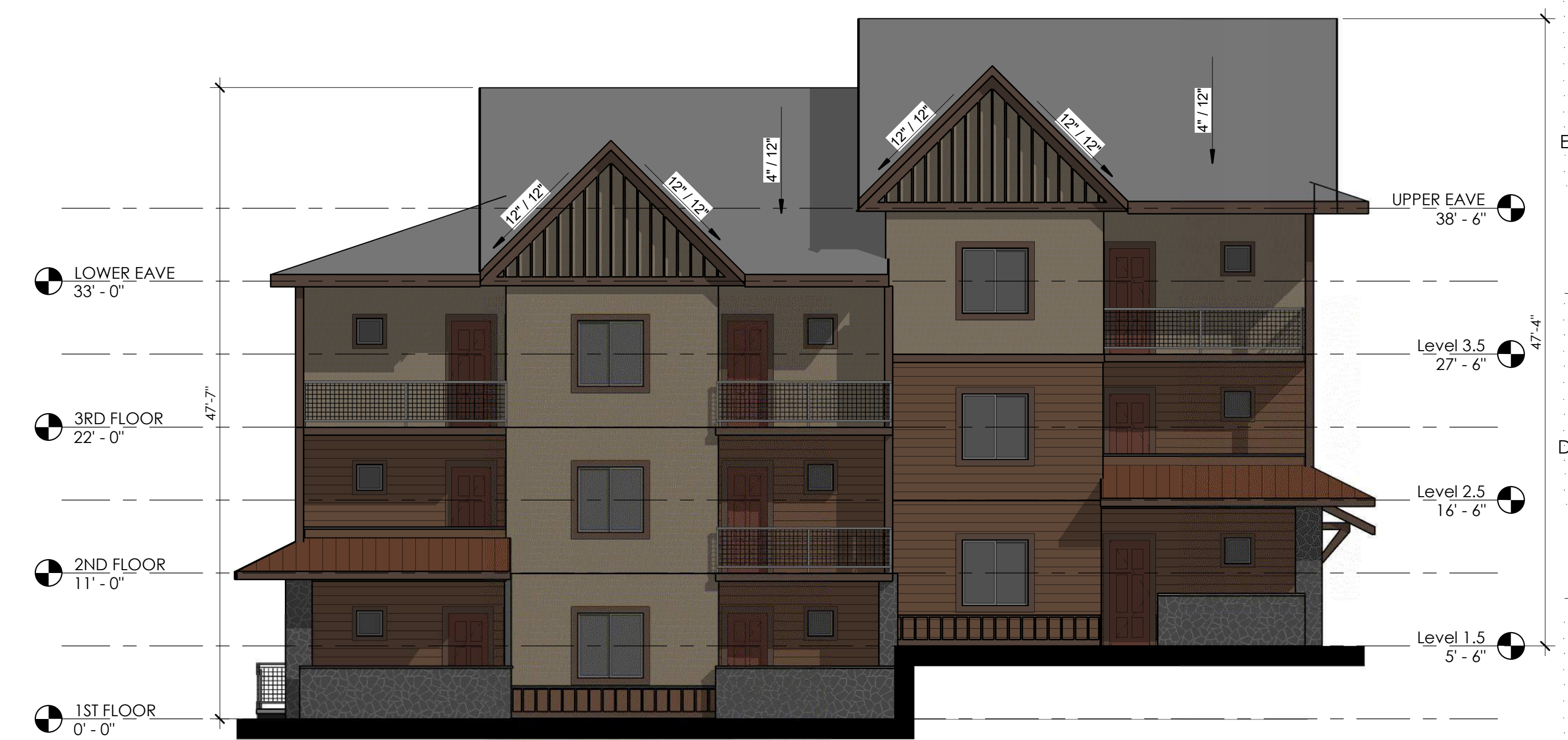
A6 EAST ELEVATION SCALE: 1/8" = 1'-0"