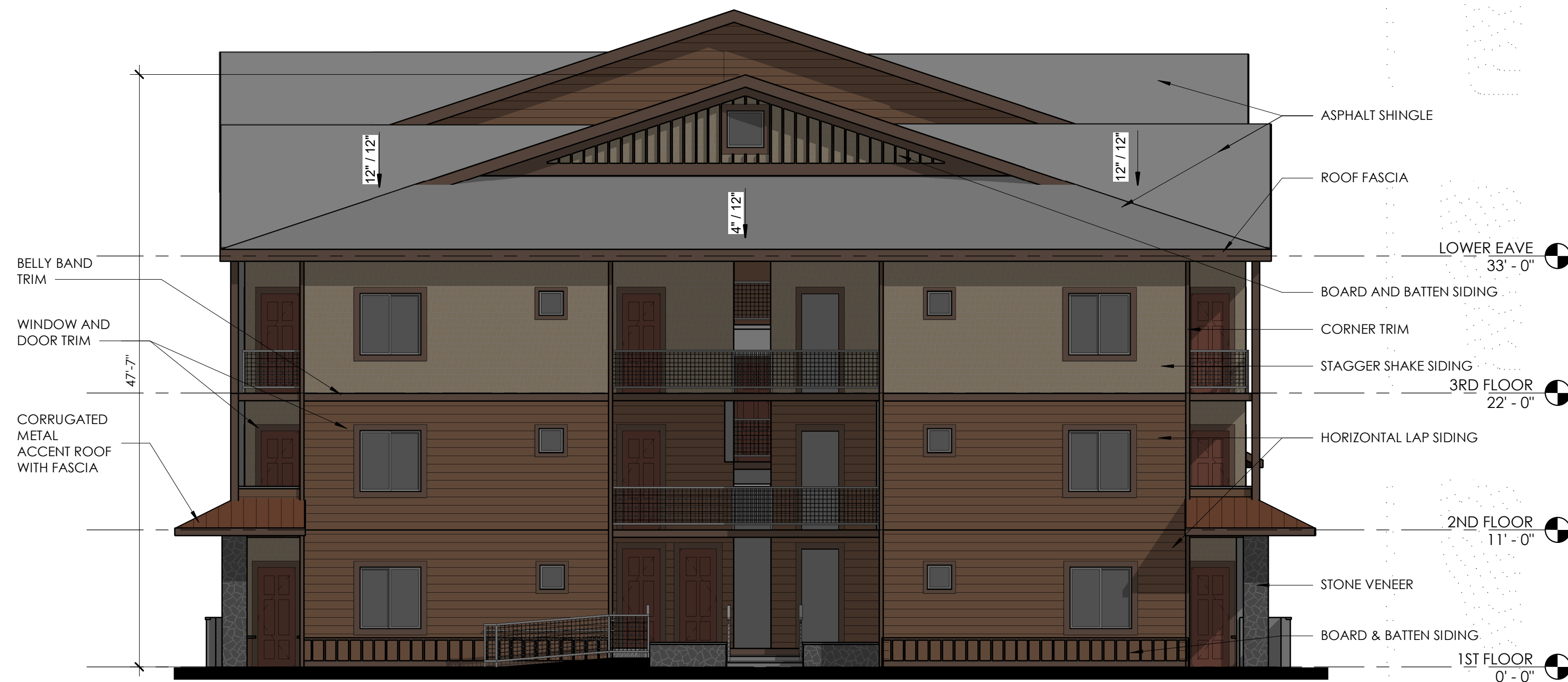
E1 SOUTH ELEVATION SCALE: 1/8" = 1'-0"