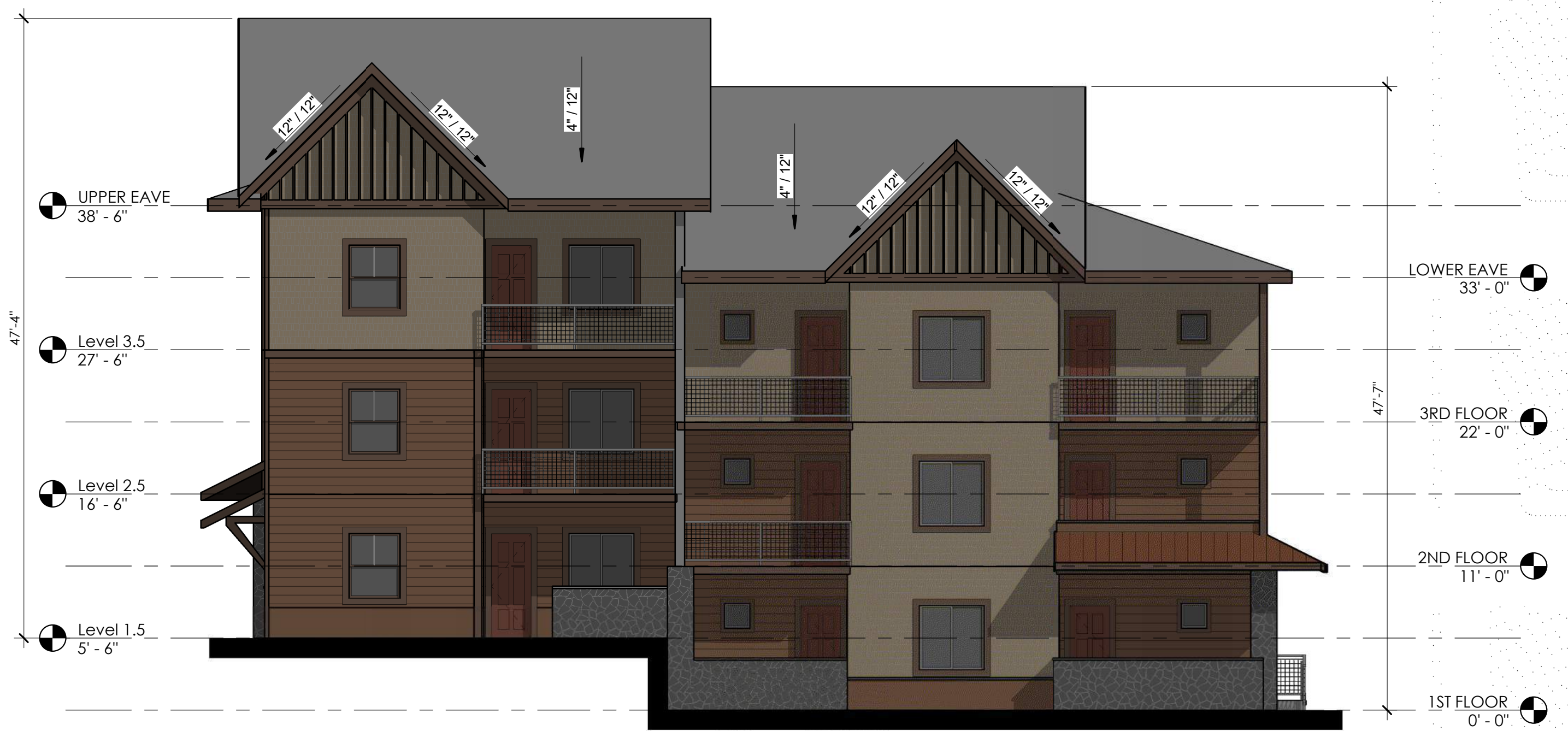
A1 WEST ELEVATION SCALE: 1/8" = 1'-0"