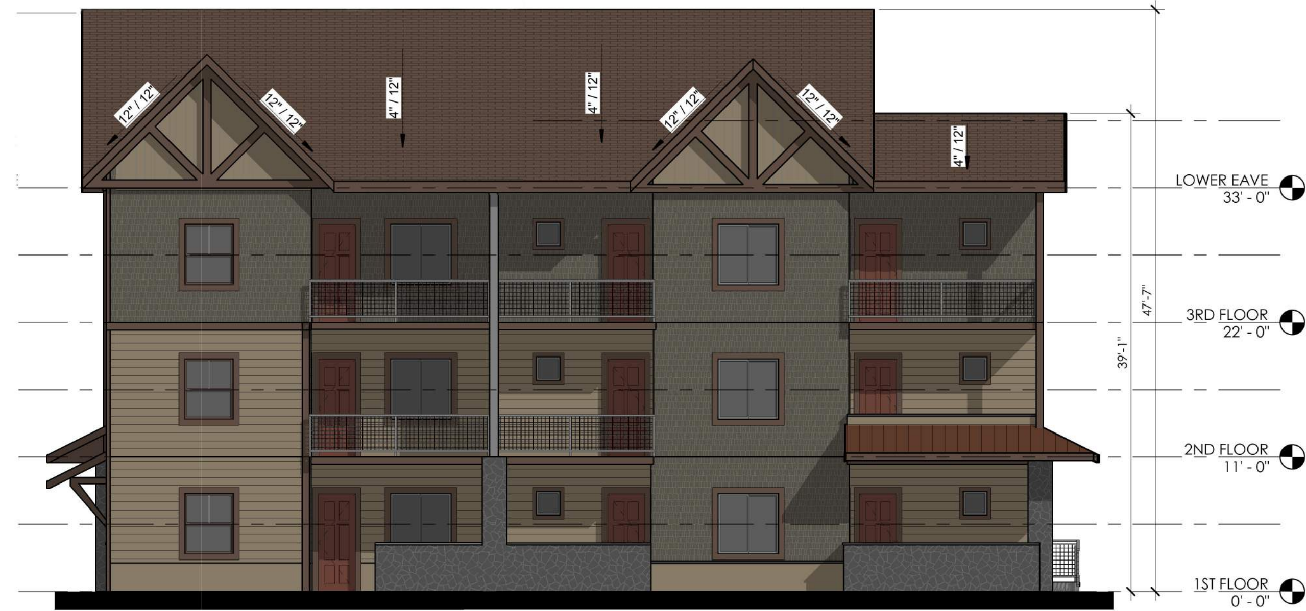
A1 WEST ELEVATION SCALE: 1/8" = 1'-0"