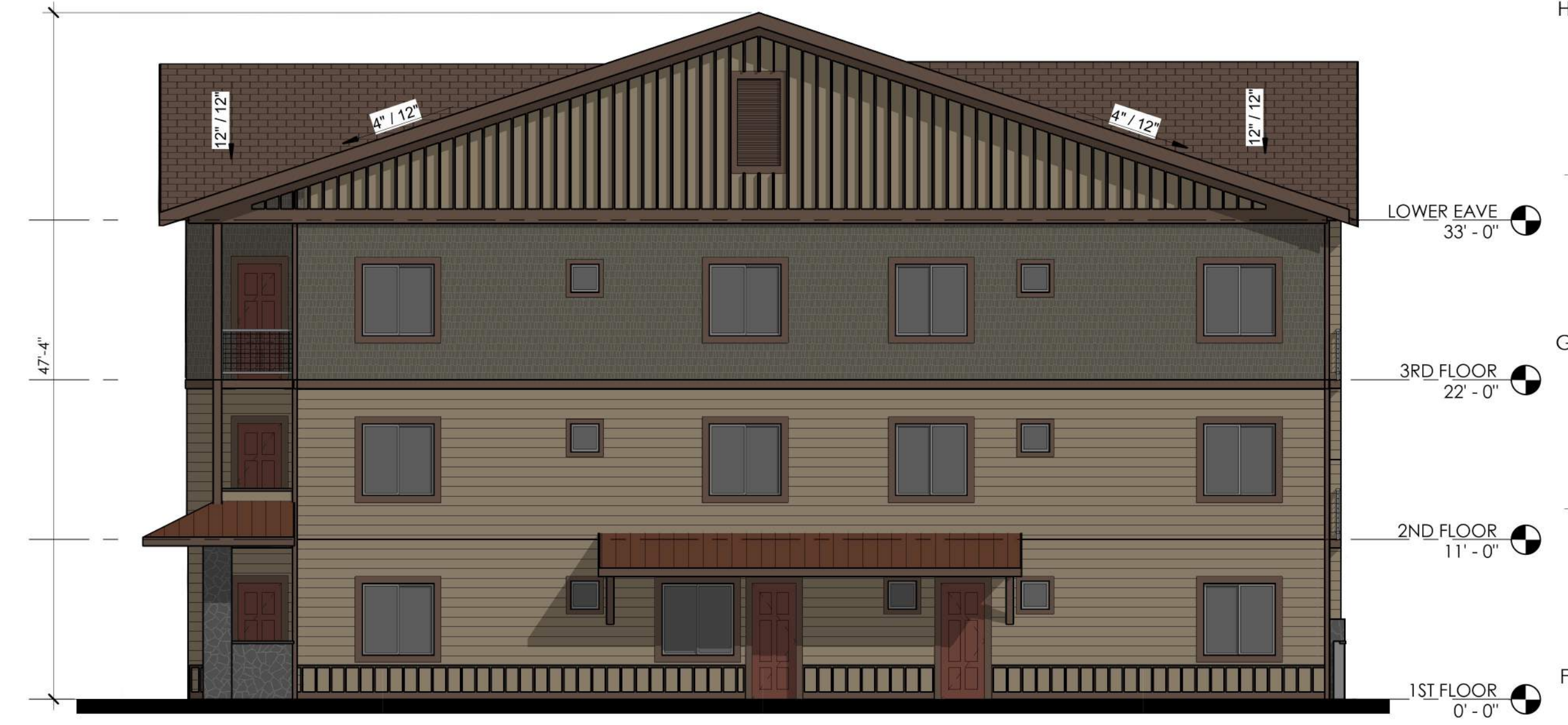
E6 NORTH ELEVATION SCALE: 1/8" = 1'-0"