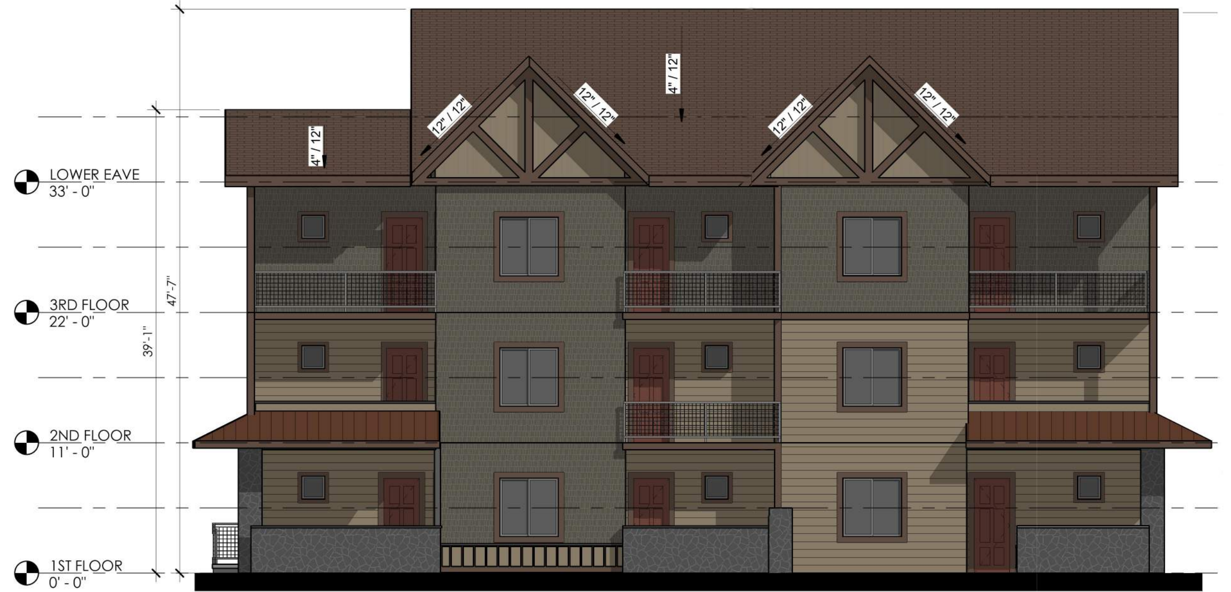
A6 EAST ELEVATION SCALE: 1/8" = 1'-0"