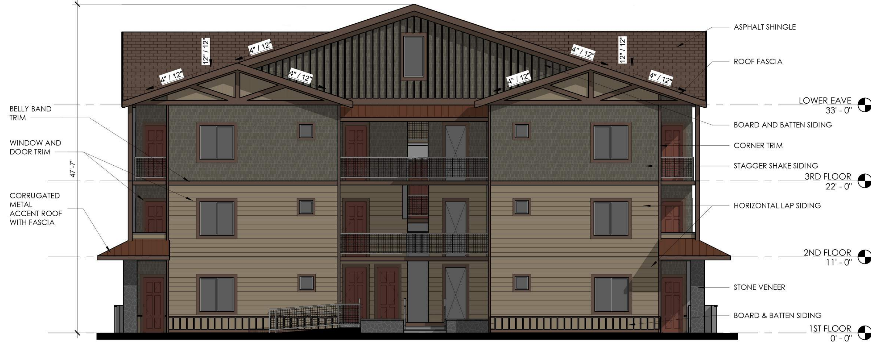
E1 SOUTH ELEVATION SCALE: 1/8" = 1'-0"