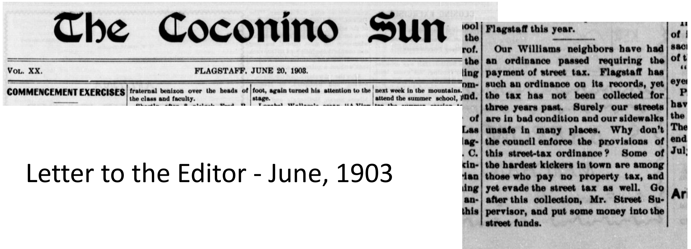
Letter to the Editor - June, 1903

-First adopted in July 14 th 1903, amended in 1916 and 1989.