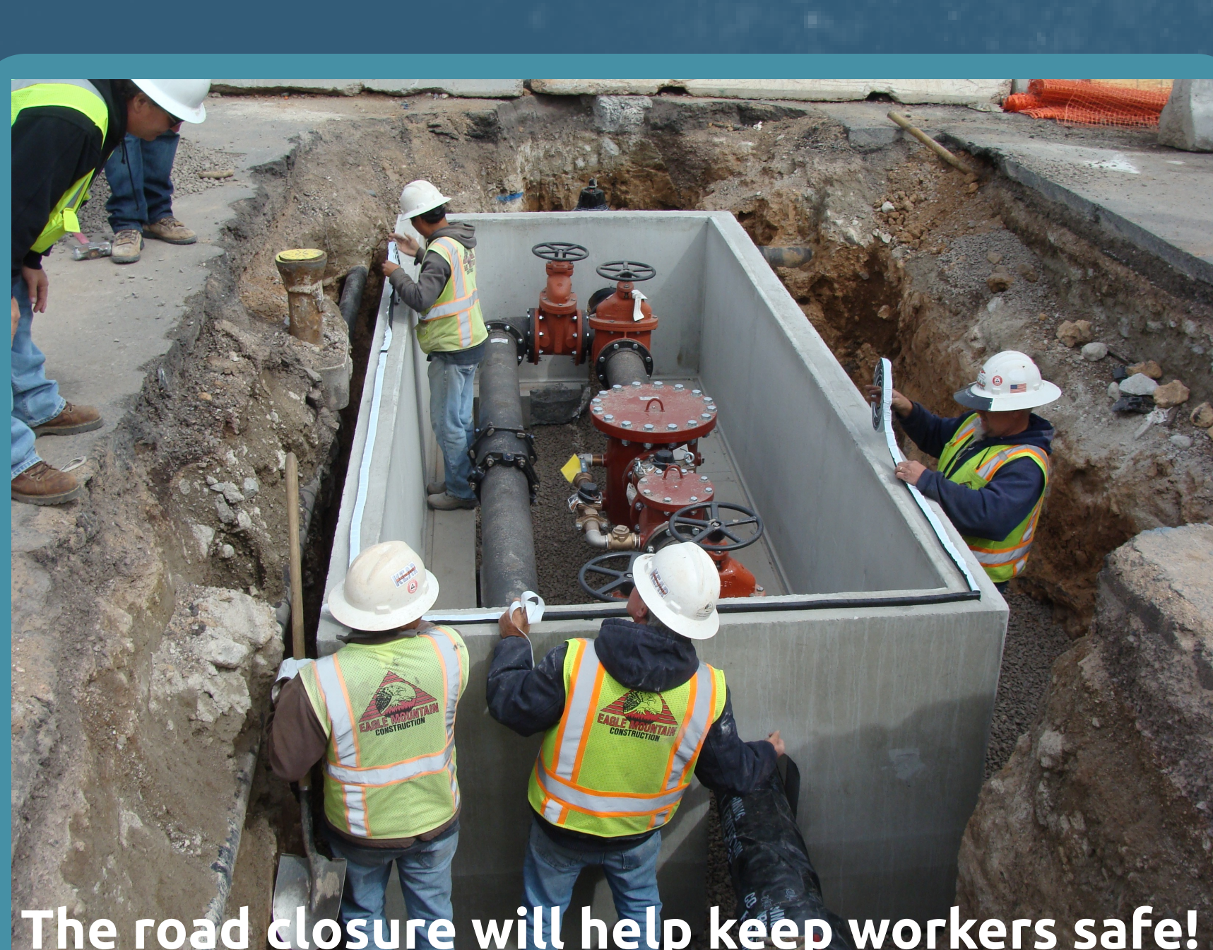
The road closure will help keep workers safe!