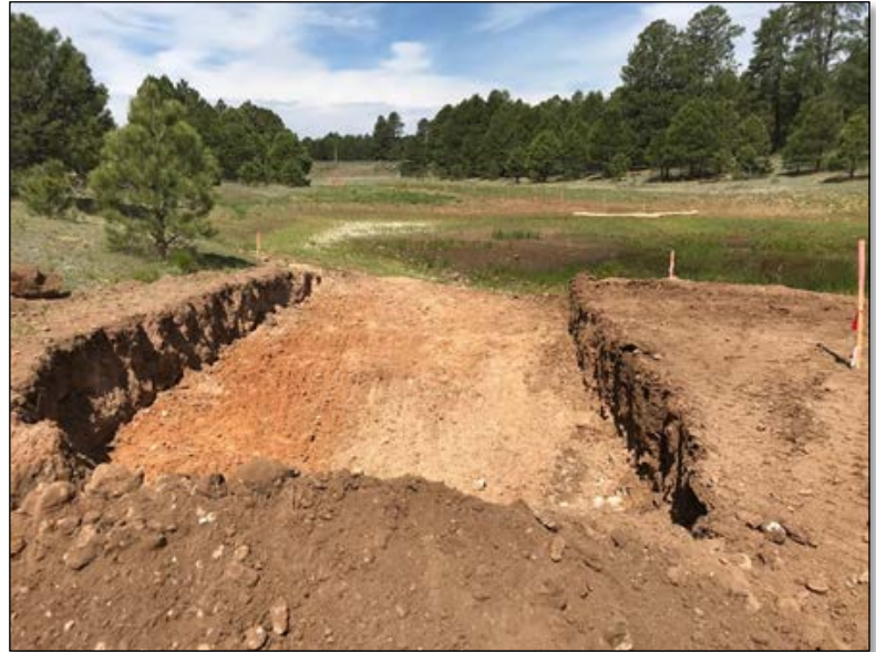
View to the west of Interstate Tank and the lowering of the current spillway.