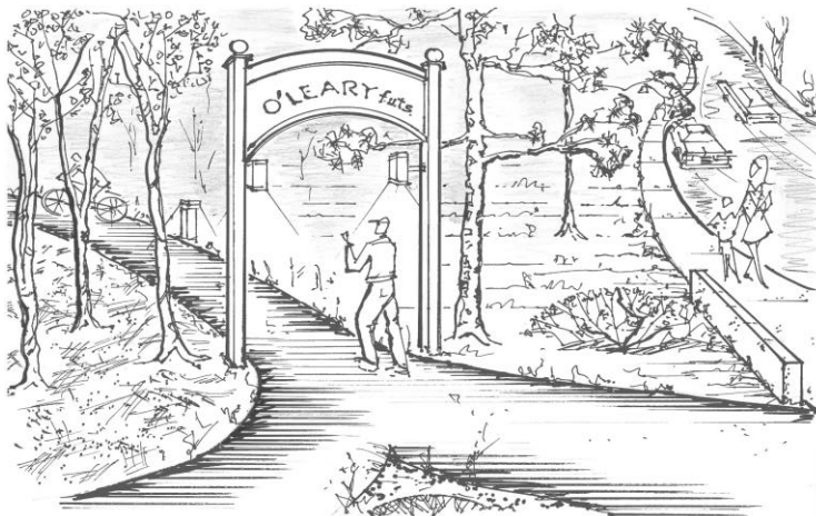
FUTS @ Lone Tree entrance

Lighted trail with post lights & neighborhood fencing