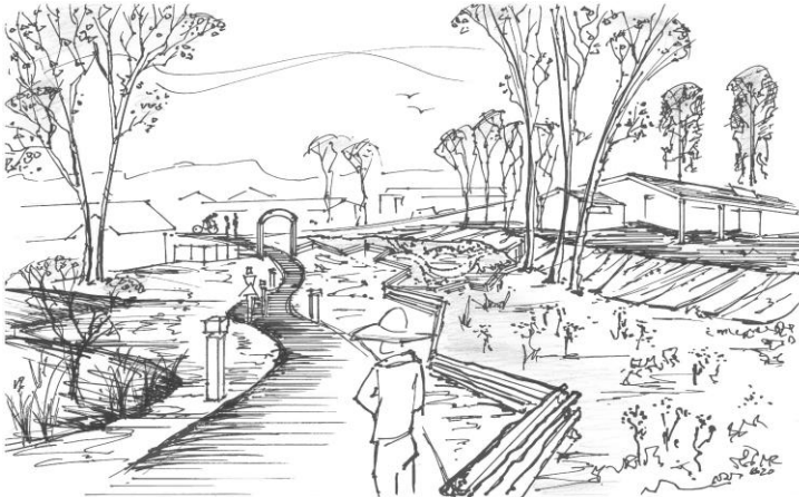
FUTS along Rio de Flag w/ pollinator garden

Lighted trail with post lights & neighborhood fencing