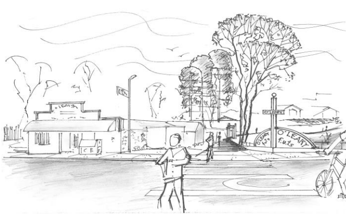
FUTS @ O'Leary

The proposed FUTS is planned to run from Lone Tree Road to O'Leary Street, it parallels the Rio de Flag on City of Flagstaff owned land.