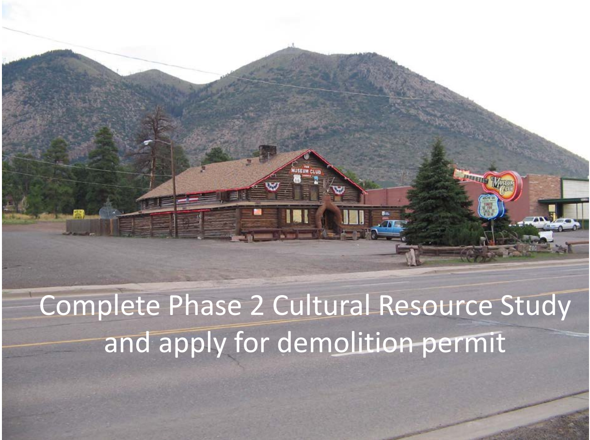
Complete Phase 2 Cultural Resource Study and apply for demolition permit

The Commission does not have authority over what replaces the building or the design of the building unless it is in an overlay district with design standards.