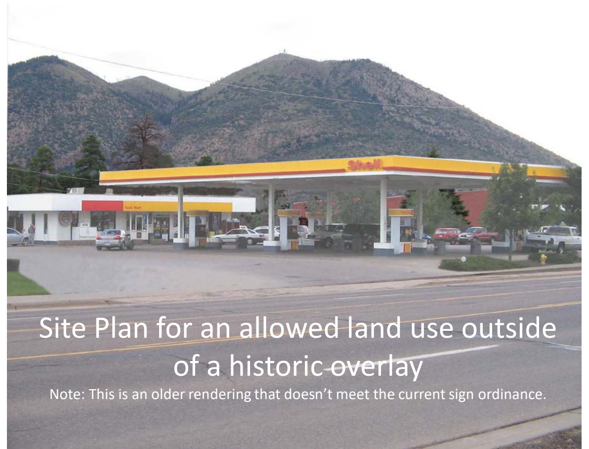
Site Plan for an allowed land use outside of a historic overlay

Note: This is an older rendering that doesn't meet the current sign ordinance.