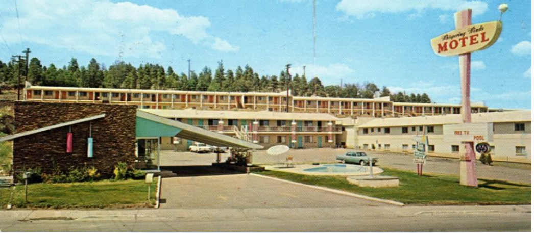
Reference Photo Only | Scale: NTS